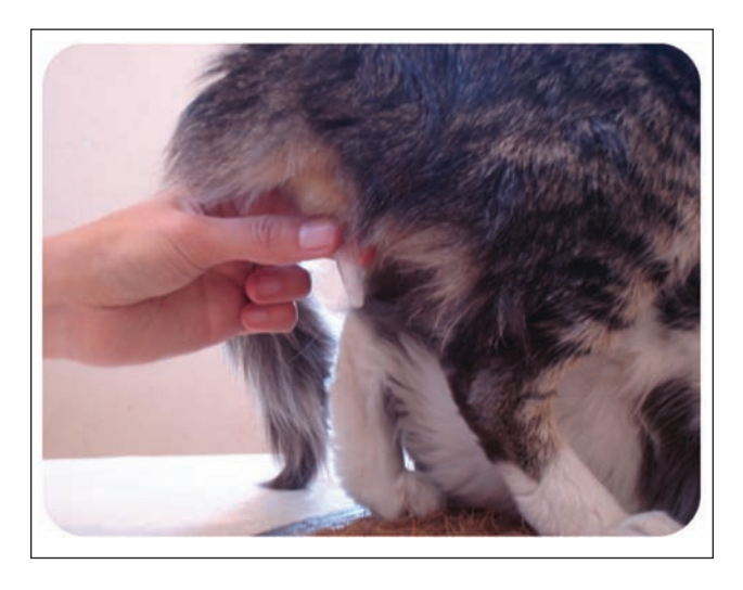
Figure 2 Erect cat penis from which semen has been recently collected by an artificial vagina