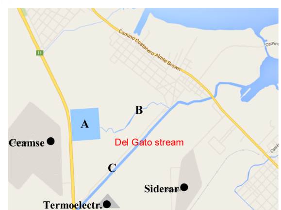
Figure 1 Map of the study area: Los Patos Lagoon (A), El Zanjón stream (B) and Del Gato stream (C)

As shown in Figure 1, Del Gato stream flows through the ground in SW-NE, and lagoon communicates with the stream by a small channel of just over 1 km called the Zanjon, and the whole system ends later in the Santiago River to finish in the river of La Plata. To the left of the lagoon is Diagonal 74 Street, the main route of communication between Punta Lara and the city of La Plata, which is a physical division with the sanitary landfill of Coordinación Ecológica Área Metropolitana Sociedad del Estado (CEAMSE).