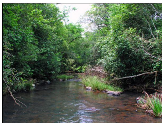
fig 4. (right). Arroyo Shangay at low-water, río Uruguay basin, Misiones Province