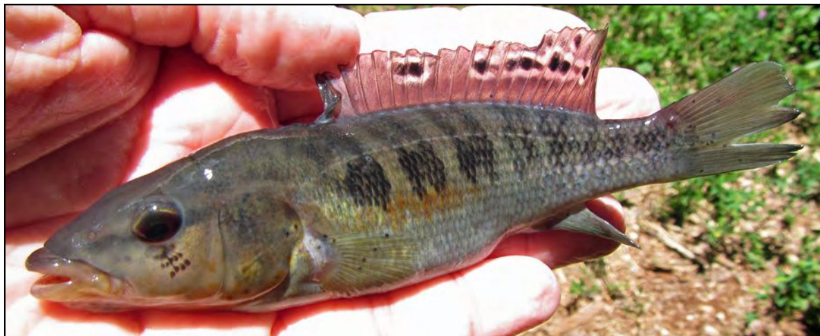
fig. 1. Adult female of Crenicichla yaha (MLP 11215) in breeding coloration. Arroyo Falso Uruguay-i. Note lack of spotting on body distinguishing C. yaha from C. tesay . Note orange coloration on flank also distinguishing C. yaha from C. tesay , but similar to sympatric C. ypo and all related species in the Middle Paraná. Note black elongated spot in dorsal fin with white margin as in all related species in the Paraná/Iguazu (including C. tesay ) except the sympatric C. ypo (where there is a orange band in ventral portion of the dorsal fin and a black band above it without a white margin). This character difference in the dorsal fin from the sympatric C. ypo suggests sexual selection and species recognition.

tesay (usually whole more greyish) and 6) slightly less scales in E1 row. Distinguished from the other molluscivorous species C. taikyra by points 4 and 5 (point 2, breeding coloration of females, is not known in C. taikyra ), by having a distinctly more robust head and body (both almost without overlap) and by having distinctly less scales in E1 row (also without overlap). Distinguished from all other species in the C. mandelburgeri group by the molluscivorous-associated characters (robust LPJ, robust LPJ teeth, robust head with short jaws and hypognathous mouth). Distinguished from all species in the C. missioneira group (that also include molluscivorous species) by well developed suborbital stripe (vs. very weakly developed and diffuse, composed of a few isolated spots at best).