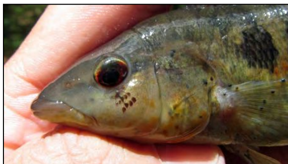
fig. 2. Detail of head of the same female of C. yaha . Note sub-terminal hypognathous mouth similar to C. tesay but different from the prognathous mouth of the sympatric C. ypo .