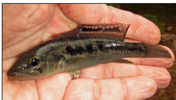
fig. 4. Young female of C. yaha (MLP 11217) from arroyo Urugua-í. Note black elongated spot in dorsal fin.