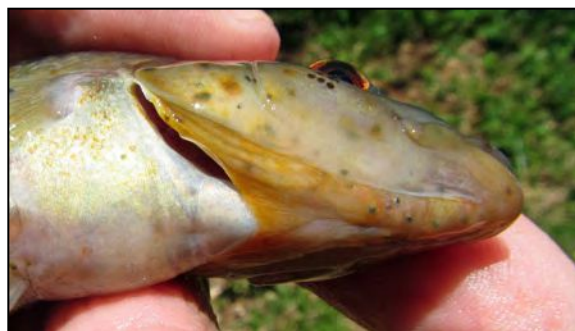
fig. 3. Detail of lower portion of head of the same female of C. yaha showing orange branchiostegal membrane distinguishing C. yaha from C. tesay and the sympatric C. ypo (where in both cases grey).