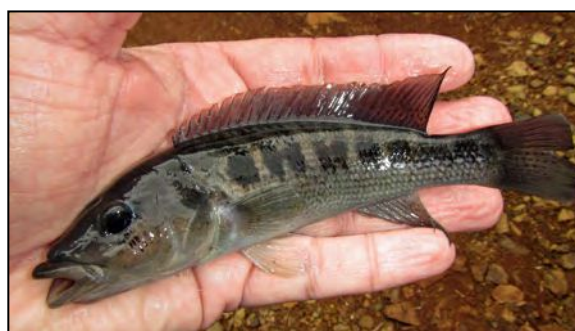
fig. 5. Adult male of C. yaha (MLP uncatalogued) from the arroyo Urugua-í. Note spotted dorsal fin distinguishing males from females.

Distribution and ecology. Crenicichla yaha is endemic to the Urugua-í basin above the original 28 m high waterfall, i.e. above the present dam. It does not however occur in the artificial lake which has everywhere a muddy bottom but is apparently only found in the middle stretches of the main stream and its main tributary (arroyo Falso Urugua-í; figure 6) in areas with bottoms made of stones, boulders and solid rock. Here C. yaha is syntopic with the much more common C. ypo and in rare cases with the undescribed predatory C. sp. Urugua-í line which is common only in the artificial lake. Crenicichla yaha is apparently not present in the upper parts of the main river and the larger tributaries (Falso Urugua-í, Uruzu) and also not in the small tributaries where in all cases only C. ypo is present or where cichlids are absent (headwaters of small tributaries).