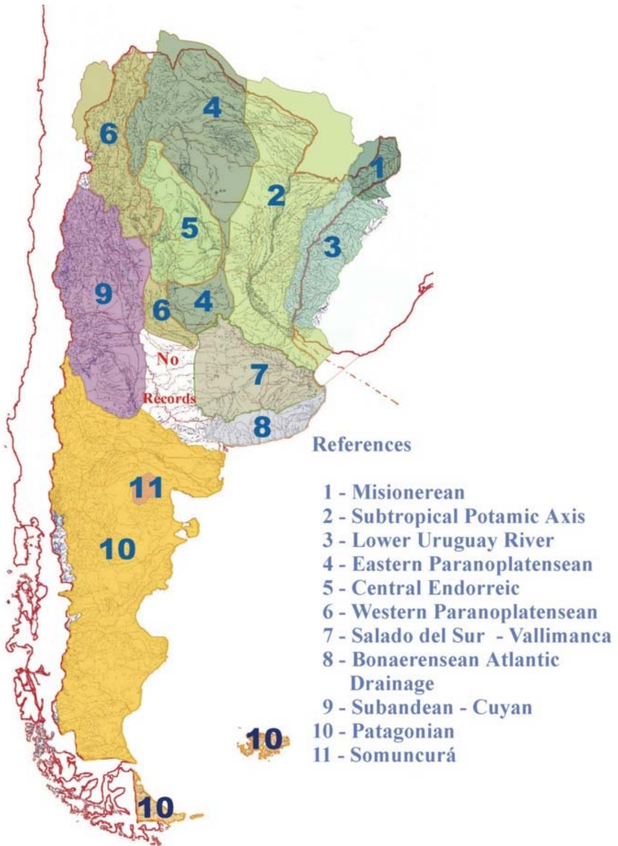
Figure 1. Map of Ichthyogeographic Ecoregions of Argentina