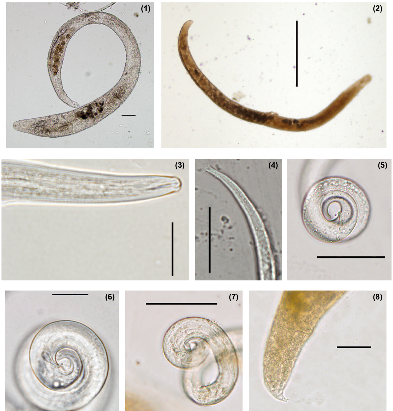
Figure 1–8. Parasitylenchus pseudobifurcatus sp.n. (1) First generation entomoparasitic female. (2). Second generation parasitic female. (3) Anterior end of vermiform infective female. (4) Posterior end of vermiform infective female, showing tail bifurcated. (5) Posterior end of male showing the spicules triangular shaped and gubernaculum laminar. (6) Posterior end of male showing the spicules in bowling bottle shape. (7) Posterior end of male showing the spicules and gubernaculum long and wide. (8) Posterior end of female showing the tail bifurcated. Bars = (1) 100 \mu\text{m} ; (2) 500 \mu\text{m} ; (3, 6) 20 \mu\text{m} ; (4, 5, 7, 8) 50 \mu\text{m} .

Males (Figs. 5, 6, 7): pharyngeal glands atrophied; tail tip angular-truncate, showing bifurcation in juveniles; spicules straight, in bowling bottle shape or triangular, with wide base. The gubernaculum long can assume several shapes, laminate and in bowling bottle shape. Usually it is straight, however it may be bent upward, or rarely appear double. Unfortunately the small size of this structure hinders further analysis. The bursa is absent