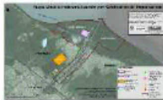
Map 2: Model stage industrialization by import substitution

Between 1950, and later in 1990 a new process of industrial specialization of the Port is generated and at the same time a decadence of the refrigeration activity begins. Thus, to the Río Santiago Shipyards (1936), the Textile Cooperative of Labor (1940) is added the Military Factory of Sulfuric Acid (1952) and later Petroquímica Ipako (1962), Propulsora Siderúrgica (1969, of the Techint group, private sector at the mouth of the Arroyo Zanjón on the Santiago River), Petroquímica General Mosconi (1974), Copetro SA (1978), the creation of the Berisso Technological and Information Technology Pole (1989) and the operation since 1990 of an Industrial Estate the port industrial profile. It is, then, an industrial vocation linked, in part, in association with the oil industry. The development of the same will be focused mainly on the Ensenadian margin, unlike the meat industry in the previous period, on the Berisian margin. Parallel to these changes, towards the end of the 1950s, the National State cedes the use of 70% of the port to the YPF distillery, reaching 90% the export of the port in fuels (Sanucci, 1983)