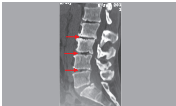
Figure 2. Sagittal section of the Multi Slice Tomography showing vacuum phenomenon in the first 4 lumbar discs.