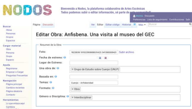
Figure 1. Form for a Play

Once the user saves the changes or creates a page for a Play, the page in an understandable manner can be seen. For example, Figure 2 shows the page of the work that was published in the form of Figure 1. The title of the Play is the page title showed at the top of Figure 2, then on the left of the Figure is displayed the content and text of each element. On the right side of the page, a user can see a box containing a representative picture of the work and below it is shown a summary of the Play (Infobox).