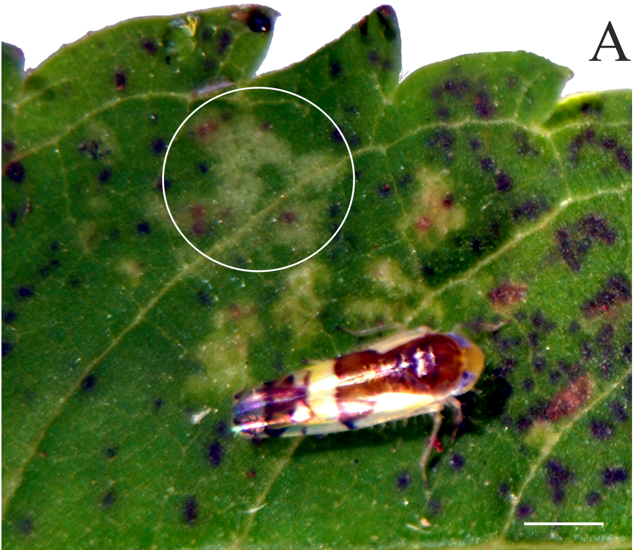
FIGURE 3. A. Damage by Rhabdotalebra albinoi n.sp. (Circle indicating the damage in the form of rings and horseshoes on leaves of “Guarán-Guarán”). Scale bar=1mm.

Seventh sternum (Fig.2A) subrectangular, posterior margin with short rounded median lobe. Pygofer (Fig.2B) in lateral view, with group of six or seven macrosetae on medioventral margin and six to eight macrosetae on dorsocaudal margin, dorsocaudal apex with one dark sclerotized and prominent spine. Valves of the ovipositor exceeding pygofer (Fig.2B, D). Second valvulae leaflike in third apical, very similar to R. litoralensis , but without teeth. Large valve (Fig.2C) dorsal margin and apex without teeth, with 2–3 sclerotized longitudinal bars of different size on surface, branched towards dorsal margin. Small valve (Fig.2C) similar, without teeth.