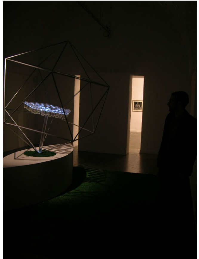
Figure 1. Grupo Proyecto Untitled and Joaquín Fargas, Incubaedro (2008).

These activated a fan, which imitated the movement of the wind; a water pump, which simulated rainfall; and a pulley system, which brought an in vitro orchid out of an acrylic hemisphere, alluding to the birth of a new kind of organism designed in the laboratory.