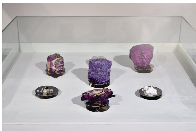
Figure 5. Agustín Bucari, Morfogénesis S/Z (2018).

The installation, Morfogénesis S/Z [Morphogenesis S/Z] (2018) shows the different states of two materials: red cabbage ( Brassica oleracea ) and Potassium alum (Fig. 5). These materials were chosen based on the concepts of what the organic and the inorganic, not as a binary opposition, but rather as malleable, converging qualities that relate to one another. For example, when creating alum crystals, terms like “cultivation,” “germination,” or “growth” are used, which evoke organic characteristics. However, when Bucari observed cabbage leaves under the microscope, he found a structure of rigid, straight lines, a geometric pattern that repeats itself and relates to the inorganic forms of the design. The artwork is thus not only about the ambiguity between the organic and the inorganic but also the crossover between art and science.