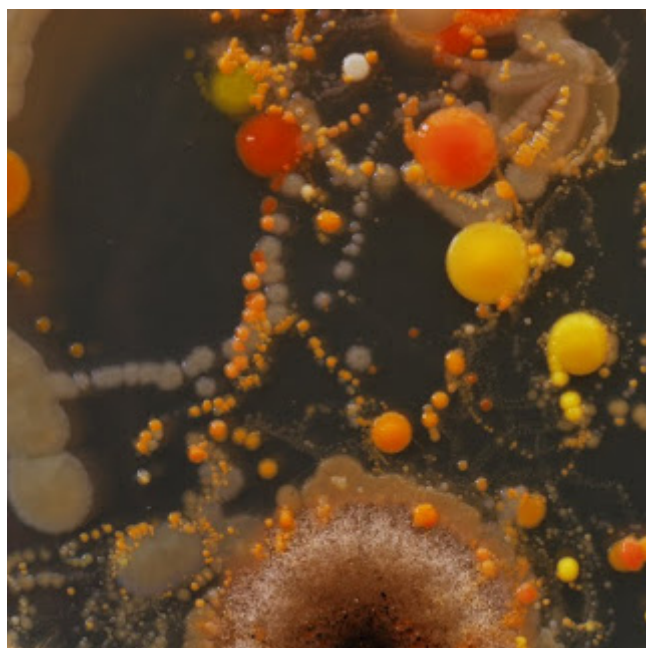
Figure 2. Luciana Paoletti, Portraits (2009).

For the Paisajes [Landscapes] series, she photographed microorganisms that she collected from the banks of the Paraná River at sunset, on the night of carnival, or in Plaza San Martín in Rosario.