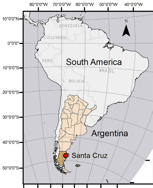
Fig. 1. Location of Deseado Massif, represented by a red dot in the map at the northeast of Santa Cruz Province, Argentina.

human bone assemblage recovered at a looted Late Holocene aboriginal cairn burial ( chenque ) located at the Piedra Museo archaeological locality, in the northeast sector of the Deseado Massif. The assemblage consists of 56 heavily weathered bone specimens (comprising both anatomically identifiable and unidentifiable elements and fragments), all belonging to a single human individual. The burial, known as chenque “El Sargento”, corresponds to the hunter-gatherers who inhabited Patagonia in Late Holocene times. The chenques are a kind of funerary structures that consist of a variable number of stone blocks of different size and shape placed directly on one or more corpses, forming low-height piles that can take a generally elliptical shape of variable dimensions (Barrientos et al. 2007; Magnin, 2010). As for its chronology, a bone sample (left patella) was radiocarbon dated at 727 \pm 48 ^{14}\text{C} years BP (Miotti, 2006), i.e. 717–555 cal BP (2 sigmas; SHCal13.14c calibration dataset on Calib 7.04). The reason why it was possible for lichens to colonize this bone assemblage is that the funerary structure was opened and disturbed by modern looters, who left the bones exposed to the action of subaerial agents for a yet undetermined period of time, likely of the order of several decades considering the growing of lichens on highly weathered bone surfaces.