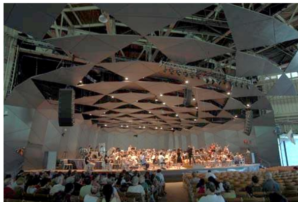
Figure 2. Picture of the hall. 2

Although it is a hall with a huge seating capacity -5,121 listeners- and its floor is not, a priori, very suitable for music, the acoustical design chosen places it among the best halls in the USA according to the specialized critic.