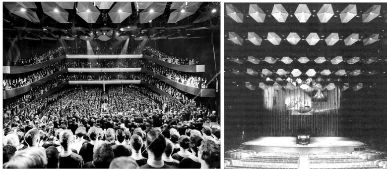
Figure 1. Pictures of the interior of the hall. 1

In the acoustical result, the sound was flat and too bright, without spatial feeling, without good responses in low frequencies. The musicians could not hear one another and there were echoes on the stage and in some seats at the front. Nothing could be further from the excellent shoebox halls of the 19 th century, which theoretically had been the basis of their design.