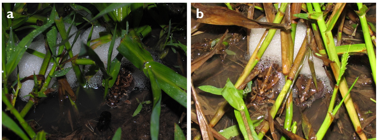
Figure S2. Two different processes of communal nest construction in P. santafecinus : synchronic oviposition (a) and heterochronic oviposition (b).