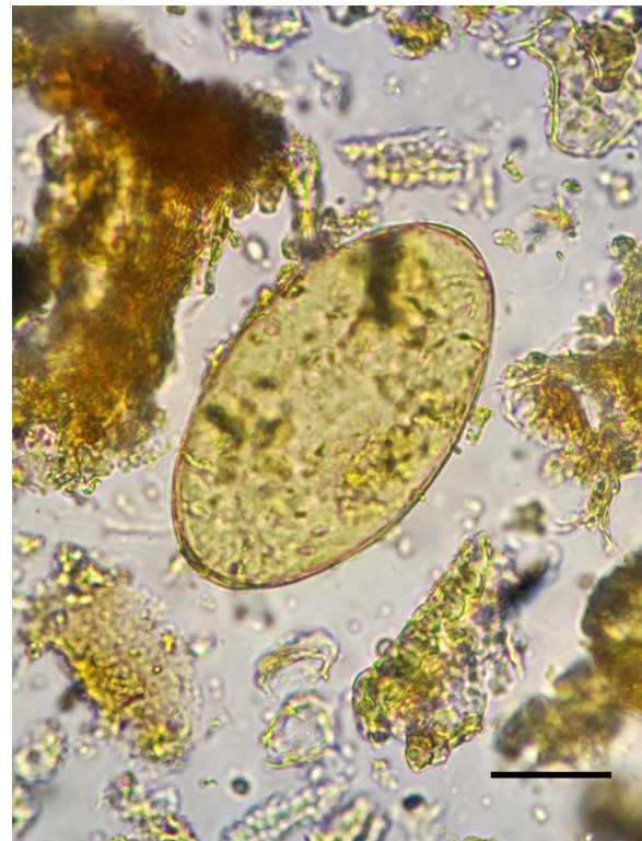
Fig. 1. Ancient trematode egg found from deer coprolites from 'Cueva Parque Diana' archaeological site, Patagonia, Argentina. Bar = 40 µm.

DNA was extracted using the ZR Fecal DNA Miniprep kit (Zymo Research, Irvine, CA, USA), following the manufacturer's instructions. PCR reactions were individually carried out for each partial fragment of the mtDNA genes coding for NADHI and COI. Each reaction was constituted into a final volume of 50 µL, containing 37.5 µL of ultrapure distilled water (Invitrogen), 5 µL of 10×