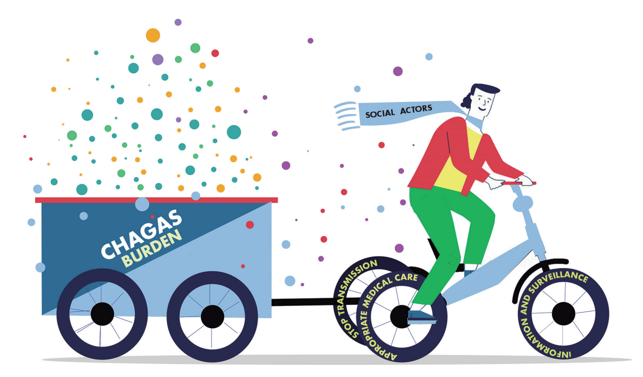
Fig 2: tricycle strategy of the World Health Organization Programme on Control of Chagas disease.<sup>(17)</sup> (Graphic adaptation: Iván Pasanau)