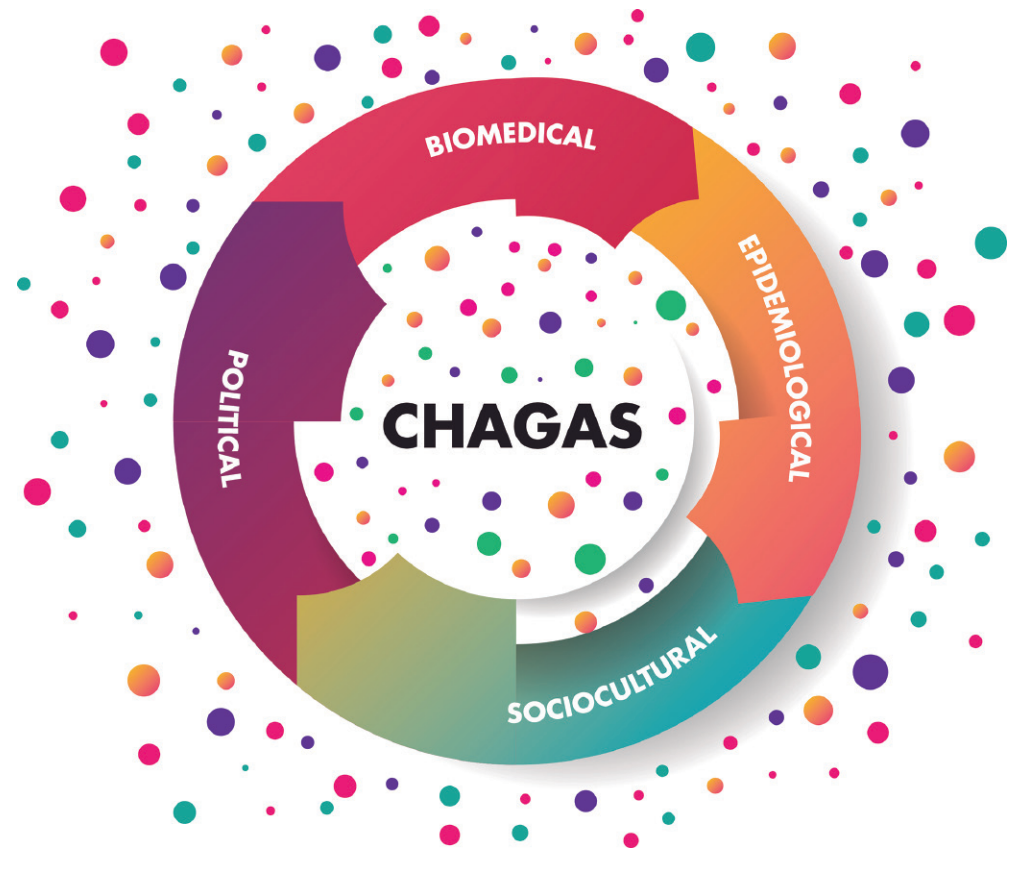
Fig. 3: the "kaleidoscopic puzzle" of Chagas.<sup>(19)</sup> (Graphic adaptation: Iván Pasanau)

- The epidemiological dimension concerns aspects that characterise the situation on a population scale, using parameters such as prevalence and incidence, dis-