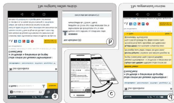
Fig. 2. The original mobile Web site and the augmented version

Wayra is reading about “CrossCheck”(a), but the article has just two comments at the bottom of the page (b). She wants to read more opinions so, in this kind of situation, she used to copy the title, open a new tab, visit Twitter and perform a search using the copied text as keywords. However, this process became tedious for her and she eventually stopped doing it. She would like to retrieve tweets in the same context of the article easily. Besides, the extra interactions make her feel uncomfortable to perform it with a single hand, and she would like to use single-handed tilting gestures to show and hide an extra section with related tweets at the top of the article, as in steps “c” and “d”.