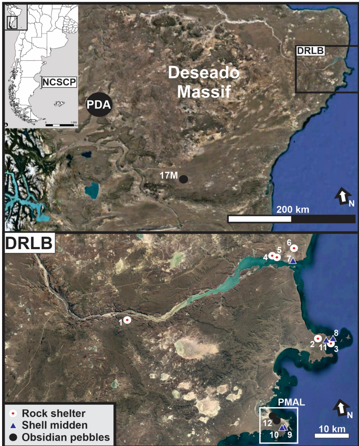
Figure 1. Location of the obsidian sources and archaeological sites containing obsidian. Abbreviations: NCSCP - North Coast of Santa Cruz Province; DRLB - Deseado River Lower Basin; PDA - Pampa del Asador; 17M - 17 de Marzo; PMAL - Punta Medanosa Archaeological Locality; 1 - Cueva Marsicano; 2 - Alero El Oriental; 3 -

located in the Deseado River Lower Basin area (Figure 1). The results were then analysed and compared against data obtained from neighbouring areas. The ensuing results are presented here, and describe two different periods: ca. 7,000-3,500 years ^{14}\text{C} BP and 3,500-1,000 years ^{14}\text{C} BP.