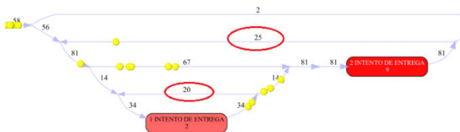
Fig. 5. Traces that do not comply with the model, in a circle the amount that goes backwards from a state instead of going forward (see direction of the arrow)

as well as cases that did follow it but outside the expected times or with task redundancy. Further analysis is required to determine if these cases represent manual load errors, and to look for a solution.