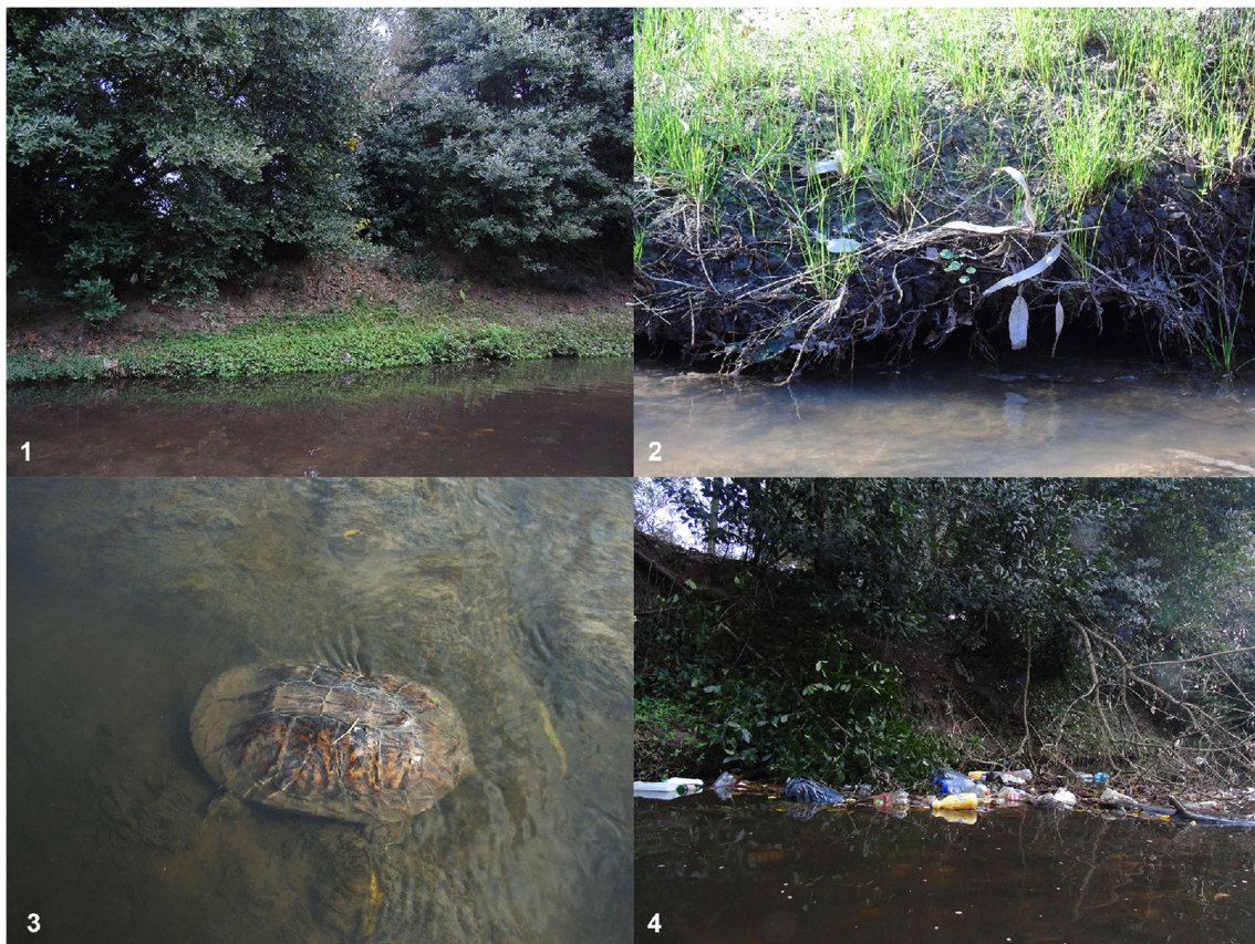
Fig. 1 Substrate types used by turtles as underwater refuges: (1) marginal aquatic vegetation; (2) hollows on the stream margins; (3) nude stream bottom, and (4) other substrate types (garbage accumulations, logs and dams composed by rests of aquatic and terrestrial vegetation that floats freely)

We caught 109 individuals of H. tectifera (mean \pm SD = 15.71 \pm 3.68 individuals/survey; n = 7 ): 56 males, 46 females and 7 hatchling turtles for which sex could not be determined.