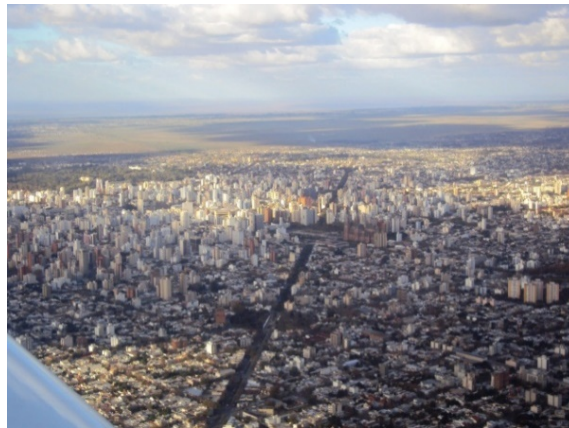
Fig. 2 Aerial Photo of La Plata.

In recent decades, La Plata underwent great changes in its historic townscape. There was also a clear degradation of its material-cultural heritage. The narrative presented in the previous sections provokes some questions that exceed the scope of La Plata in particular and serve to fuel broader thoughts on the subject: Is it necessary for a city to "crystallize" in time to be understood as a heritage asset? Still, is it possible for a city to "crystallize" in time? Can't it change and be heritage at the same time?