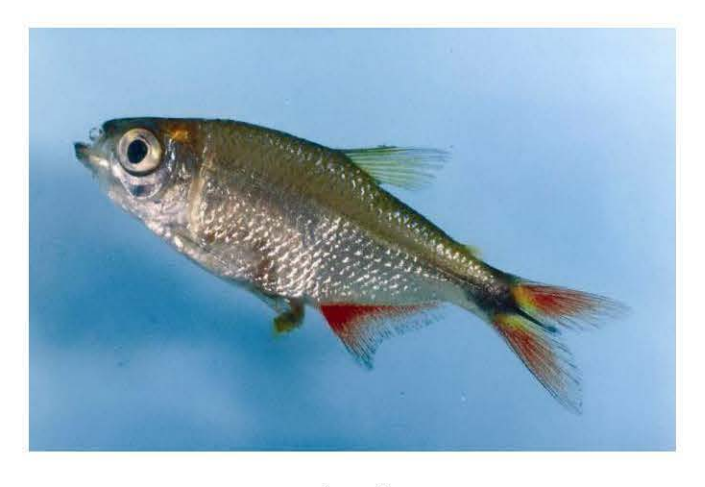
Fig. 1: Hyphessobrycon auca

Hyphessobrycon auca is a poorly known species. Besides, its apparently endemic distribution in fast-growing human activities areas requires more investigations. The aim of the present paper was to describe some aspects of the feeding of H. auca from the type locality. In this sense, this study represents the first contribution to biological knowledge of this species.