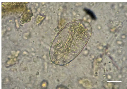
Fig. 6 Eggs found from Epullán Chica cave, attributed to Ancylostoma (Strongylida, Ancylostomatidae). Bar = 20 \mu\text{m}

Coprolite 9 contained ascaridid eggs (Nematoda: Ascarididae). Eggs were rounded and embryonated, with mamillated walls and similar to those found in coprolite 5 (Fig. 10). The average measurements of eggs were 60.56 \pm 3.42 by 49.15 \pm 2.51 \mu\text{m} ( N = 19 ).