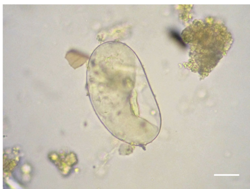
Fig. 3 Eggs found from Epullán Chica cave, attributed to ancylostomids, probably Uncinaria sp. (Strongylida, Ancylostomatidae). Bar = 20 \mu m

Oblong and larvated eggs with a thin wall were also found. Measurements ( N = 3 ) were 112.5 to 115.0 \mu m ( 113.33 \pm 1.44 ) in length and 50 to 62.5 \mu m ( 57.24 \pm 6.61 ) in width. Eggs were