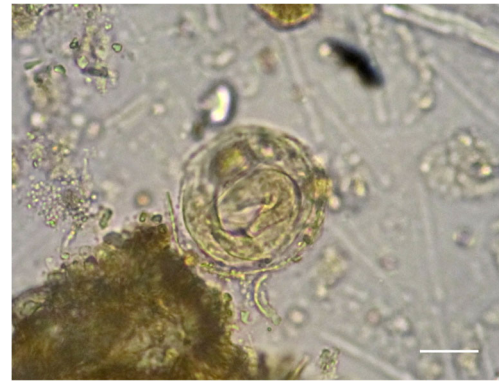
Fig. 12 Eggs found from Epullán Chica cave, belonged to the family Ascarididae. Bar = 20 \mu m