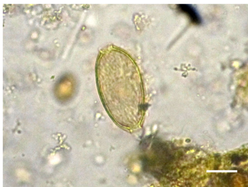
Fig. 7 Egg found from Epullán Chica cave, compatible with the capillariid Eucoleus sp. (Nematoda: Capillariidae), probably E. aerophilus . Bar = 20 \mu\text{m}

The faeces of carnivores are characterized by their cylindrical shape, with subdivisions and tapered at one of the extremities (Chame 2003). However, in C. chinga , these subdivisions are not easy to distinguish (Medina et al. 2009). Hog-nosed skunks ( Conepatus ) are carnivores widely distributed, ranging from Texas to the outermost areas of South