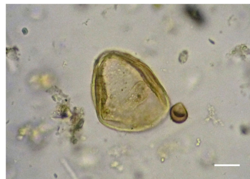
Fig. 13 Anoplocephalid egg (Cestoda: Anoplocephalidae) found from Epullán Chica cave, with characteristics attributable to genus Monoecocestus . Bar = 20 \mu m

Paragonimus species are extremely successful parasites with more than 40 species described (Blair et al. 2005). Paragonimus spp. exhibit a complex life cycle that includes a mammal as the definitive host and snails and crustaceans as intermediate hosts (crabs and crayfish). Definitive hosts usually become infected by eating raw or undercooked tissues from crustaceans. Paragonimiasis is a disease of humans and other mammals caused by several species of Paragonimus . Symptoms and signs mimic those of tuberculosis (Diaz 2013; Procop 2009). Human infections are present in Africa, Asia and America, including USA, Mexico, Costa Rica, Guatemala, Honduras, Nicaragua, Panamá, Colombia, Perú, Venezuela and Brazil (Acha and Szyfres 2003). Paragonimus