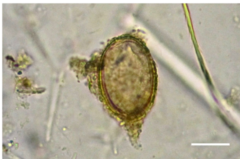
Fig. 11 Eggs found from Epullán Chica cave, possibly belonging to the family Ascarididae. Bar = 20 \mu m

Species of Physaloptera are parasitic nematodes with the adult stages living in the digestive tract of amphibians (3 species), reptiles (45 species), birds (24 species) and mammals (over 90 species) and more than 82 cases were described from humans (Mohamadain and Ammar 2012). Their life cycle includes intermediate hosts (orthopterans and coleopterans) or paratenic hosts that harbour larval forms in the outer intestinal wall (Quadros et al. 2014). Domestic and wild carnivores (cougar, lynx, badger, raccoon, fox, striped hog-nosed skunk and coyote) may be infected after eating arthropods containing third-stage larvae. The development into the adult form takes place in the definitive host and the worms lodge, preferably in the oesophagus, in the gastric mucosa and in the small intestine (Ortlepp 1922). Frequent movement of these nematodes results in erosions and ulcers in the gastrointestinal tract (Naem and Asadi 2013). Physaloptera maxillaris was the most common helminth reported from striped skunks