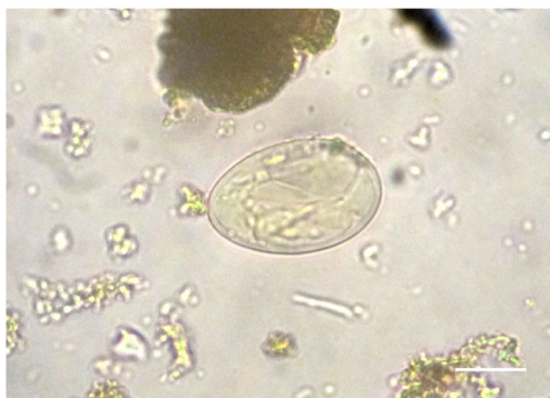
Fig. 2 Eggs found from Epullán Chica cave, tentatively attributed to genus Physaloptera sp. (Spirurida: Physalopteridae). Bar = 20 \mu m

unembryonated and operculated (Fig. 5). The posterior end was thickened. The average measurements of eggs were 80.82 \pm 1.44 by 56.33 \pm 7.64 \mu m ( N = 3 ). Eggs were attributed to genus Paragonimus (Platyhelminthes: Trematoda) (Braun 1899). Two eggs of nematodes attributed to Ancylostoma (Strongylida, Ancylostomatidae), probably A. conepati (Solonet 1911), were also found in coprolite 2 (internal sample). Eggs were ovoid with a thin shell. Measurements were 75 by 42.5 \mu m (Fig. 6).