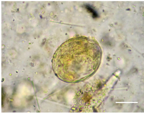
Fig. 10 Eggs found from Epullán Chica cave, belonged to the family Ascarididae. Bar = 20 \mu m

of L. griseus . L. culpaeus has a narrower diet than L. griseus , being exclusively carnivorous and their faeces are bigger (Zapata et al. 2005).