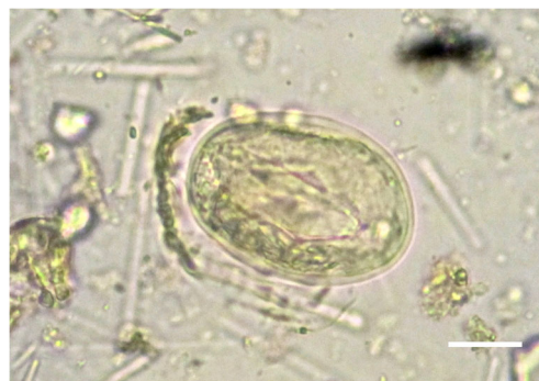
Fig. 8 Eggs found from Epullán Chica cave were probably attributed to Physaloptera sp. (Spirurida: Physalopteridae). Bar = 20 \mu\text{m}

America. The skunk C. chinga is a mephitid whose distribution ranges from northeastern Perú to southern Chile and to certain areas of Bolivia, Paraguay, Uruguay, Argentina and Brazil. Studies on the feeding habits of C. chinga suggest a generalist consumer character, in which arthropods are the most frequent prey, although small mammals are also a substantial part of its diet (Castillo et al. 2014; Donadío et al. 2004; Medina et al. 2009). Other preys include annelids, amphibians, reptiles and carrions. The morphology, diet and measurements of the examined coprolites 1, 2 and 3 were similar to those of C. chinga .