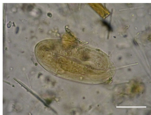
Fig. 9 Eggs found from Epullán Chica cave, compatible to Trichostrongylus sp. (Strongylida, Trichostrongyloidea). Bar = 40 \mu\text{m}

Faeces 4 to 9 exhibited the typical carnivore characteristics. Their measures and morphology correspond to those of a small canid or feline. However, the diets of Felidae tend to be more specific than those of other Carnivora, generally consisting of mammalian prey of sizes commensurate with their own body size, with little or no fish, vegetation or invertebrates (Kruuk 1986; Walker et al. 2007). In general, foxes tend to be omnivorous and opportunistic. The grey fox is both diurnal and nocturnal and occurs in a broad range of habitats from grasslands to forests, although in Argentina, it typically inhabits arid and semiarid temperate portions of Patagonia and the Andes. L. griseus is a generalist omnivore. The diet may contain plant material, insects, birds, rodents, lizards and even a high amount of fruit (Núñez and Bozzolo 2006; Zapata et al. 2005). Measurements of studied coprolites were similar to that