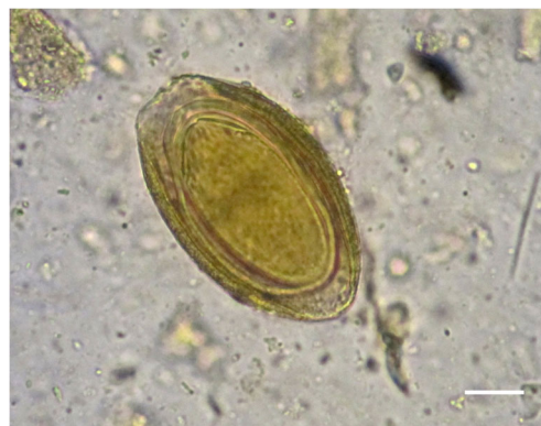
Fig. 4 Eggs found from Epullán Chica cave, identified as acanthocephalan (Archiacanthocephala, Oligacanthorhynchidae), probably Prostenorchis sp. Bar = 20 \mu m

compatible to strongylid eggs (Strongylida, Trichostrongyloidea) (Fig. 9). Their morphology and measurements were similar to those of Trichostrongylus , probably T. colubriformis . Hatched larvae were observed.