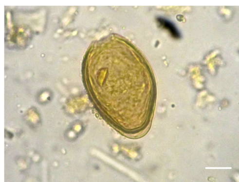
Fig. 5 Eggs found from Epullán Chica cave, attributed to genus Paragonimus (Platyhelminthes: Trematoda). Bar = 20 \mu m

Coprolite number 6 displayed one egg of anoplocephalid (Cestoda: Anoplocephalidae), with characteristics attributable to genus Monoecocestus (Beddard 1893) (Fig. 13). Measurements of the egg were 72.5 by 55 \mu m. Nematode eggs, similar to those found in coprolite number 5, attributable to Physaloptera sp., were also found. Egg measurements ( N = 6 ) were 55.0 to 62.5 \mu m ( 58.27 \pm 3.03 ) in length and 45.0 to 47.5 \mu m ( 46.23 \pm 1.37 ) in width.