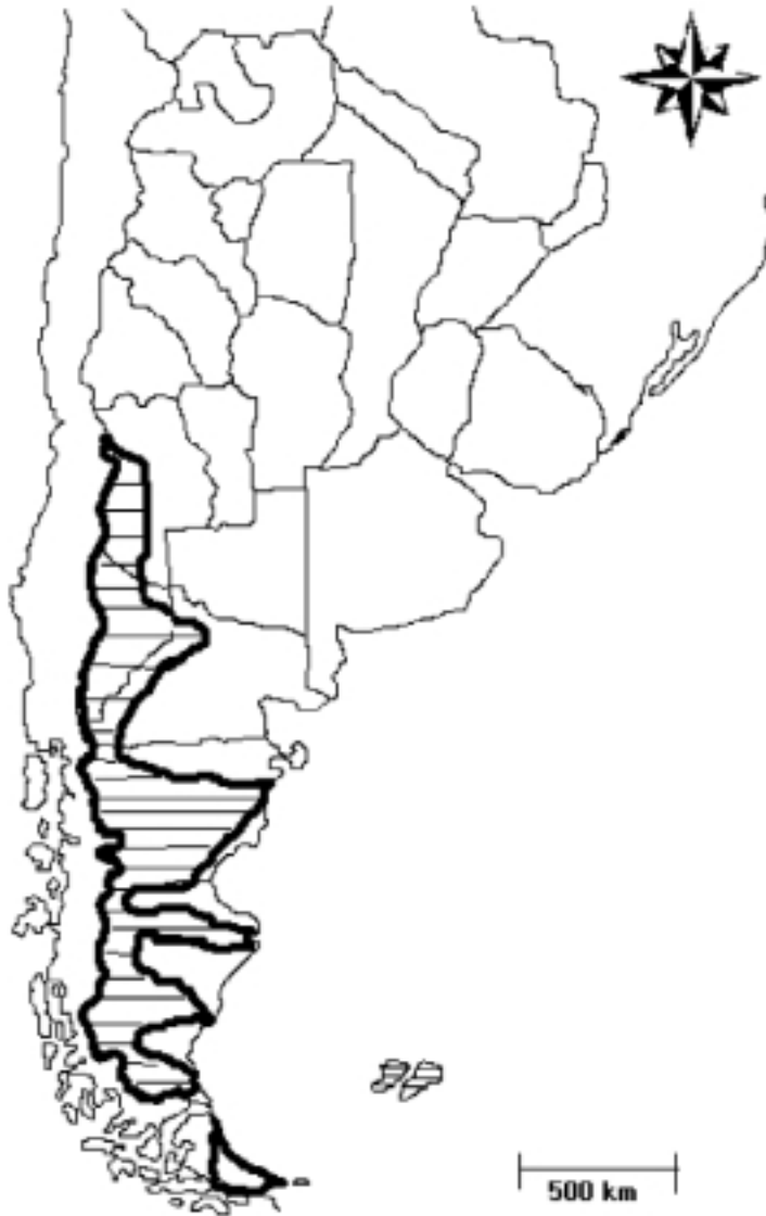
Figure 9. Known distribution of Salmo trutta . (Modified from Baigun & Quiros 1985; Pascual et al. in press; Vigliano & Alonso in press.)