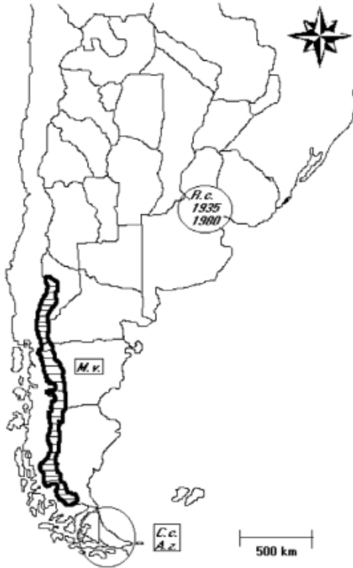
Figure 11. Known distribution of R.c. : Rana catesbiana , M.v. : Mustela vison , C.c. : Castor Canadensis and O.z. : Ondatra zibethicus .