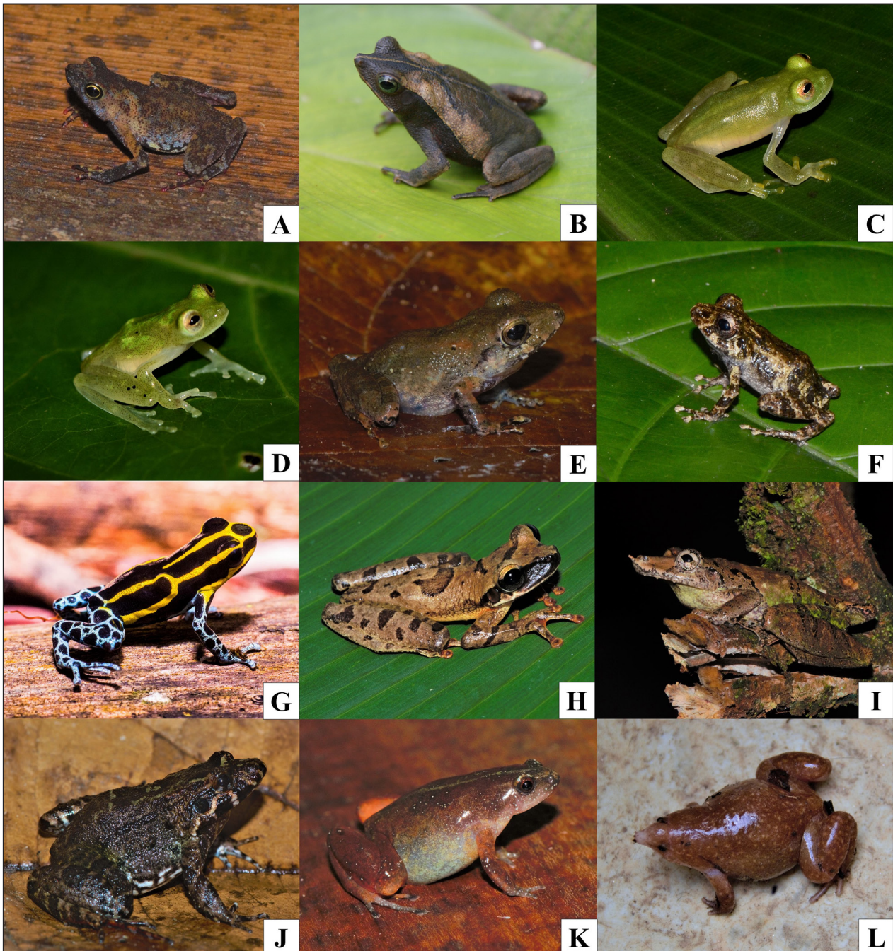
Figure 2. Anurans recorded at the Cancão Municipal Natural Park, municipality of Serra do Navio, Amapá state: A) Amazophrynella teko ; B) Rhinella castaneotica ; C) Hyalinobatrachium mondolfii ; D) H. tricolor ; E) Pristimantis gutturalis ; F) P. inguinalis ; G) Ranitomeya variabilis ; H) Osteocephalus lepieurii ; I) Scinax proboscideus ; J) Leptodactylus petersii ; K) Chiasmocleis hudsoni ; L) Synapturanus mirandaribeiroi .

during night and close to egg clutches. Hyalinobatrachium tricolor is listed as Least Concern under IUCN Red List of Threatened Species. Voucher number CECC 2783.