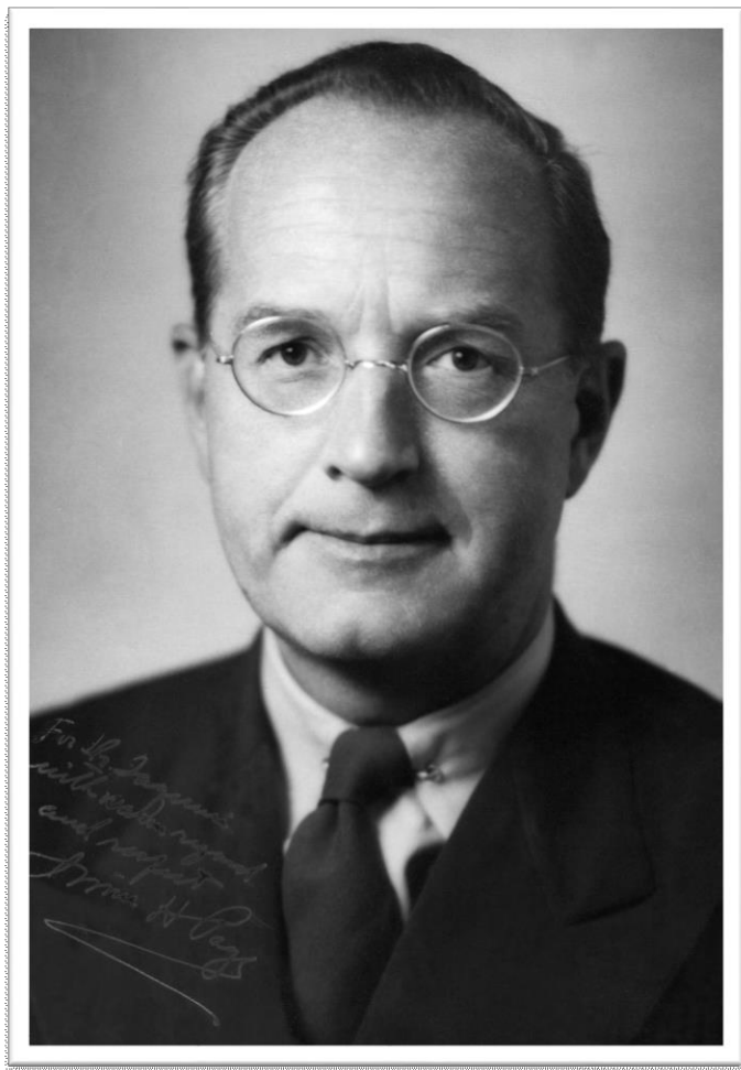
Figure 2. Original portrait of Irving Page autographed “To Dr. Taquini with warm regards and respect”.

Taquini was present at that meeting, to which he had been invited to present his experience with totally ischemic kidneys (Figure 3).