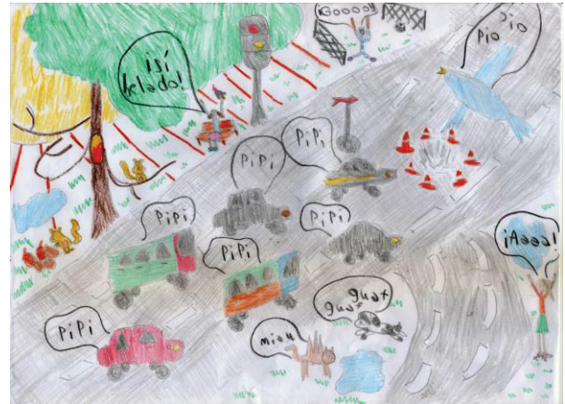
Figure 1. Drawing of one of the participants.

Among the works presented from all over the country, the jury selected seven finalists.