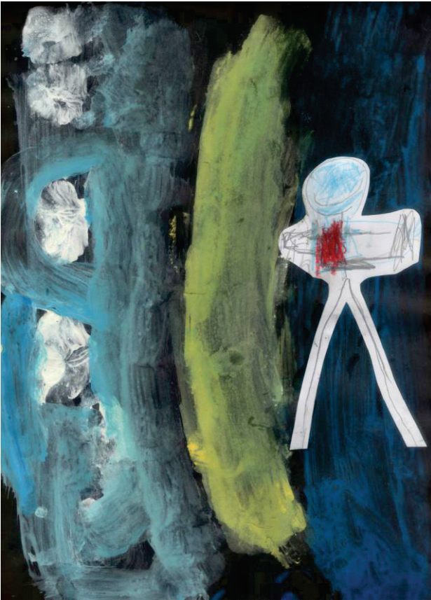
Figure 4. Drawing of one of the participants.