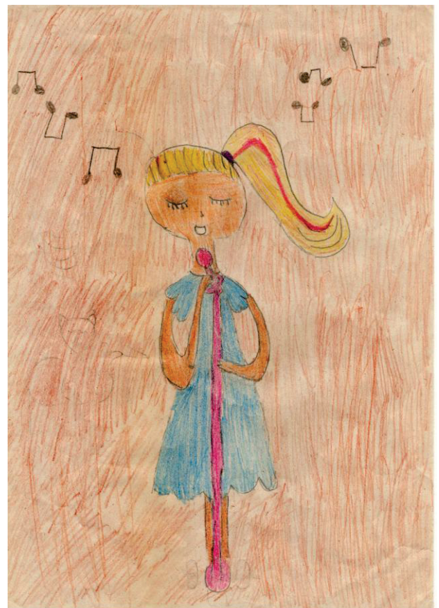
Figure 2. Drawing of one of the participants.