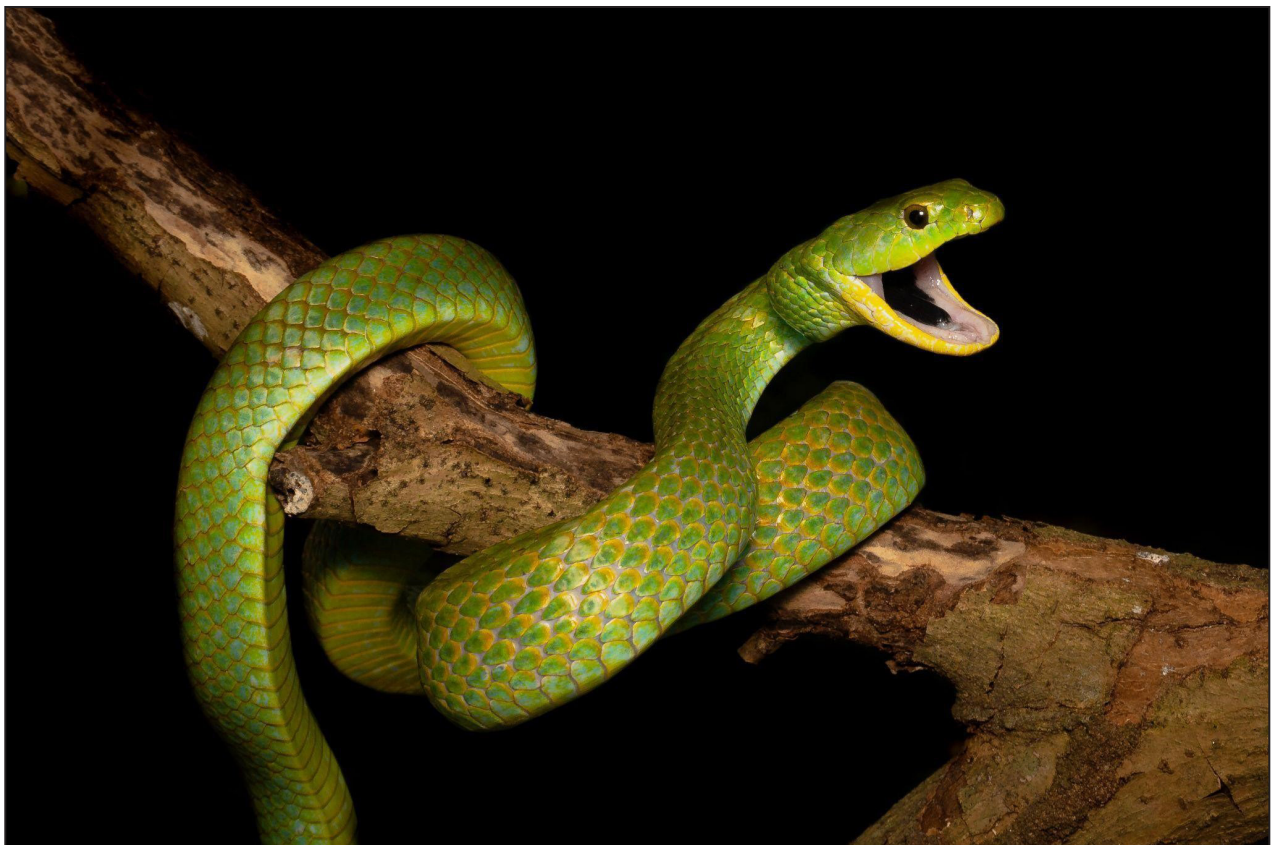
Figure 2. Chlorosoma laticeps (CHNF1044) from RPPN Caruara, municipality of São João da Barra, state of Rio de Janeiro, Brazil.