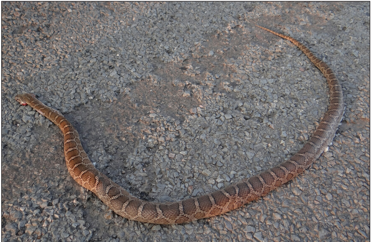
Figure 1. An adult specimen of Pantherophis emoryi (LACM PC 2763-2764) from the municipality of Paso de Ovejas, Veracruz, Mexico.

body pattern with dark brown spots, light and dark arrow-shaped markings (V) on top of head; 44 blotches on the body and 18 on the tail; 8/8 supralabial. The individual was run over in the vicinity of a pig farm. We deposited a photographic voucher for the