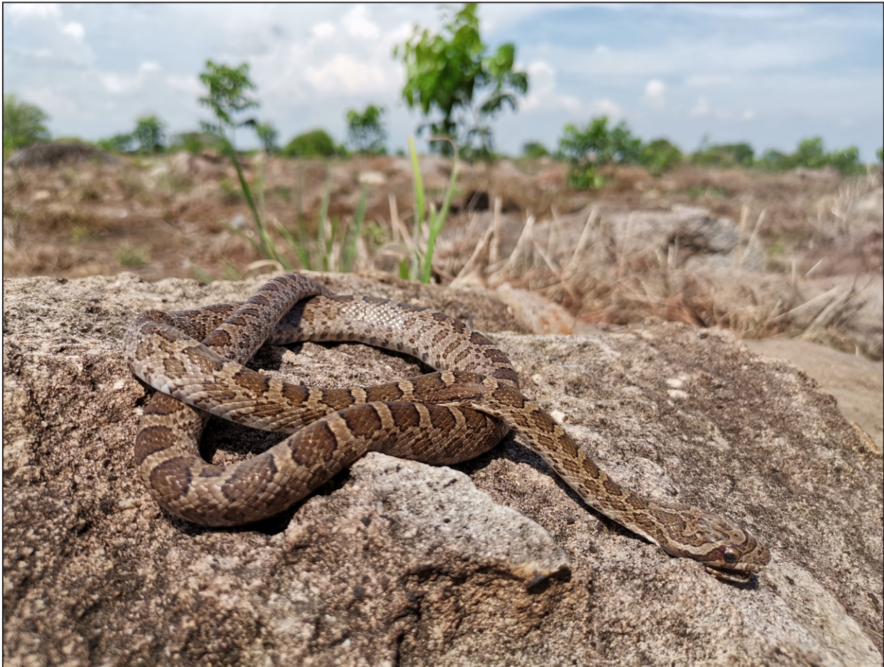
Figure 2. A subadult specimen of Pantherophis emoryi (LACM PC 2765-2766) from the municipality of Paso del Macho, Veracruz, Mexico.