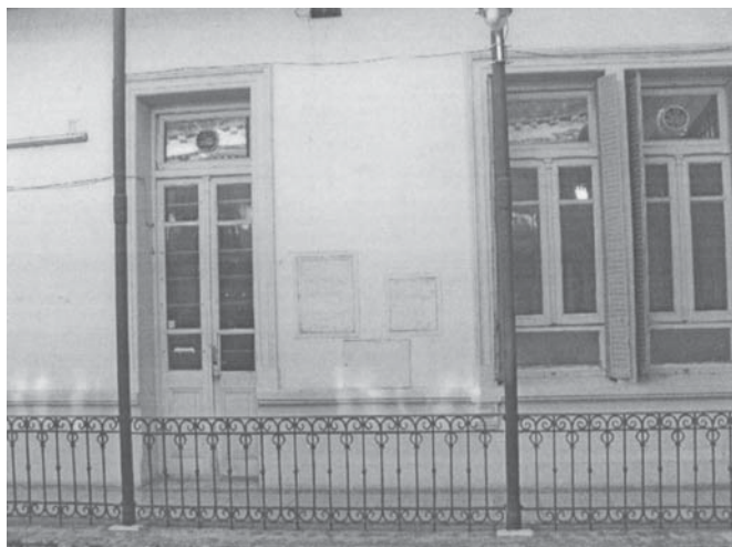
Figure 5. Corridor and main entrance to the Laboratory of Chemical Kinetics at the Advanced Scientific Research Institute “Prof. Dr. Carlos A. Sagastume”, Faculty of Chemistry and Pharmacy, National University of La Plata.