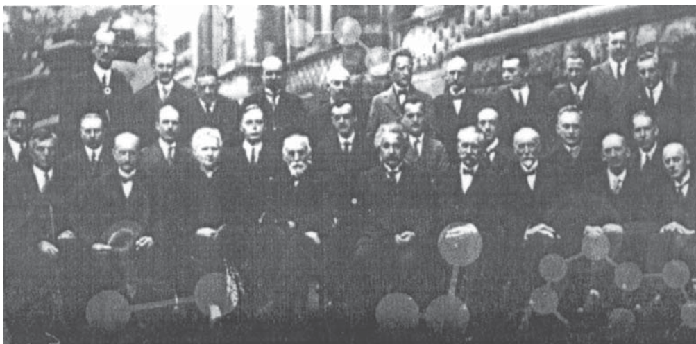
A. PICCARD - E. HENRIOT - P. EHRENFEST - E. HERZEN - T. DE DONDER - E. SCHROEDINGER - E. VERSCHAFFELT - W. PAULI - W. HEISENBERG - R. H. FOWLER - L. BRILLOUIN P. DEBYE - M. KNUDSEN - W. L. BRAGG - H.A. KRAMERS - P. A. M. DIRAC - A. H. COMPTON - L. DE BROGLIE - M. BORN - N. BOHR J. LANGMUR - M. PLANCK - MADAME CURIE - H.A. LORENTZ - A. EINSTEIN - P. LANGEVIN - C.E. GUYE - C.T.R. WILXON - O.W. RICHARDSON