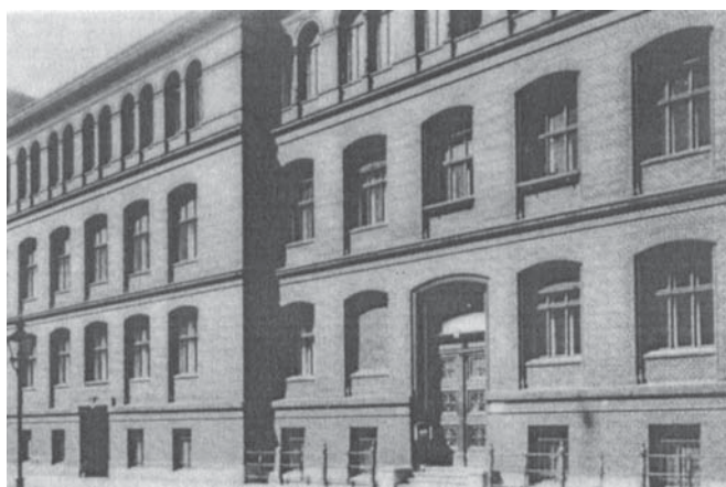
Figure 3. Building in which the Physical Chemistry Laboratorium was installed at Bunsenstrasse since Nernst's times in 1905.