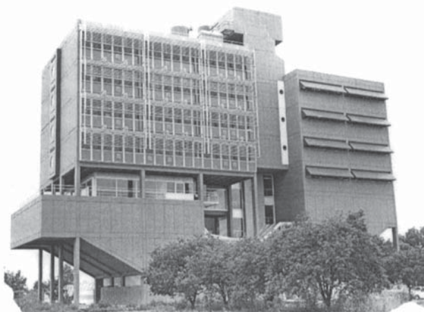
Figure 8. The new building of INIFTA, Instituto de Investigaciones Fisicoquímicas Teóricas y Aplicadas, at the premises of the National University of La Plata, inaugurated in 1975, run by the University and the National Science Research Council.

As of 1970, the Advanced Scientific Research Institute changed its name to the present one, Research Institute of Theoretical and Applied Physical Chemistry (INIFTA) (Fig. 8). This was the beginning of a new working stage through the agreement between the National University of La Plata, CONICET and CIC (Scientific Research Commission) of the Province of Buenos Aires. This agreement contributed to the Institute operation and maintenance.