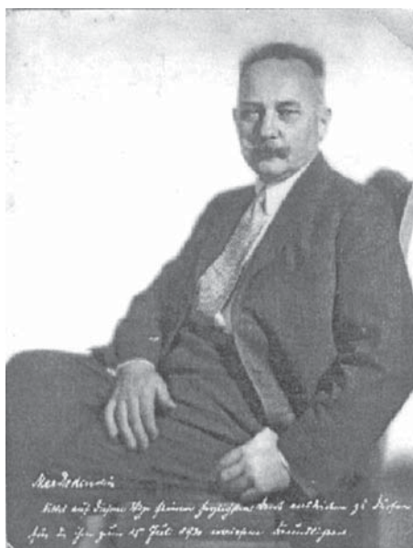
Figure 1 .A portrait of Prof. Max Bodenstein