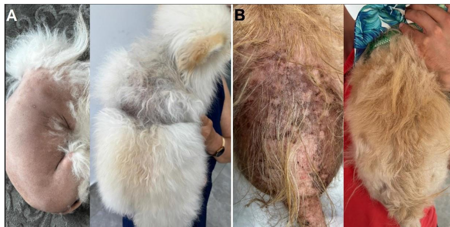
Figure 5. Baseline and treatment characteristics of two cases (A y B) at day 0 and week 6.