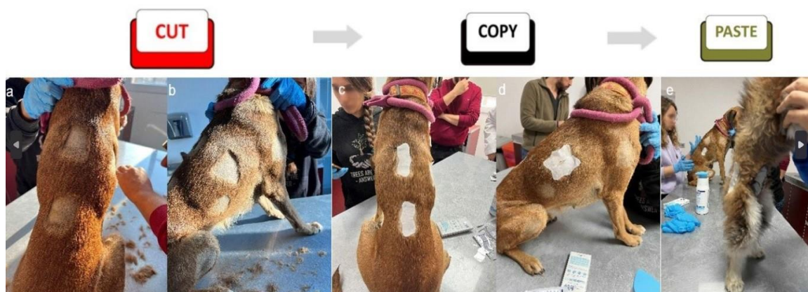
Figure 1. Skin microbiota transplantation (sMt) for cutaneous adverse food reactions in dogs. Three different stages of unenriched sMt: a-b) clipping of donor (CUT), c-d) heterologous origin of copying skin microbiota through N-cUs (COPY), and finally e) recipient transplantation of unenriched skin microbiota through N-cUs (PASTE).

A total of three healthy dogs were selected as sMt donors after screening for disease status, serum biochemistry, endocrinology, and haematology. The dogs were also checked for skin and gut microbiota analysis. No clinically relevant pathogen was detected, nor disease state was evident during the trial. In each case, at least one of the N-cUs was unboxed, and every single strip was detached. Four apparent healthy areas of skin with normal hair growth and no visible lesions were selected (Figures 1a and 1b). Strips moistened in lactated Ringer's solution (with a skin-appropriate pH of 6.5) were placed over the partially clipped areas (CUT) and allowed to adhere (COPY) for twelve minutes (Figure 1c and 1d). All strips were then transferred to the diseased and moistened skin (Figure 1e) and allowed to adhere (PASTE) for at least 15 minutes (Ural et al. , 2022, 2023). Finally, all strips were removed. None of the dogs were bathed during the trial. Unpleasant side effects involving urticaria and suddenly appearing erythema were monitored for possible existence.