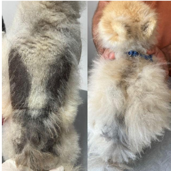
Figure 4. Skin microbiota transplantation (sMt) for cutaneous adverse food reactions in dogs. Appearance of case 1 before and after sMt (week 3).