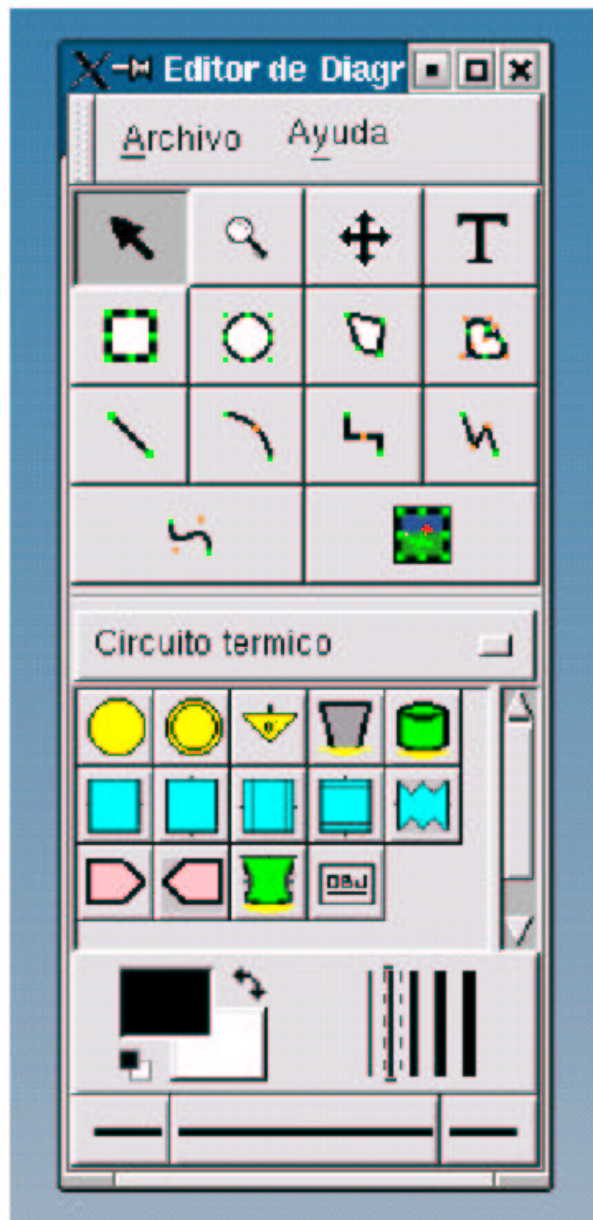
Figure 1: “Thermal circuit” sheet (“Circuito Termico”)

We designed a thermal circuit sheet with several shapes described in SVG format; and one more shape — a C-programmed one— borrowed from the UML sheet .