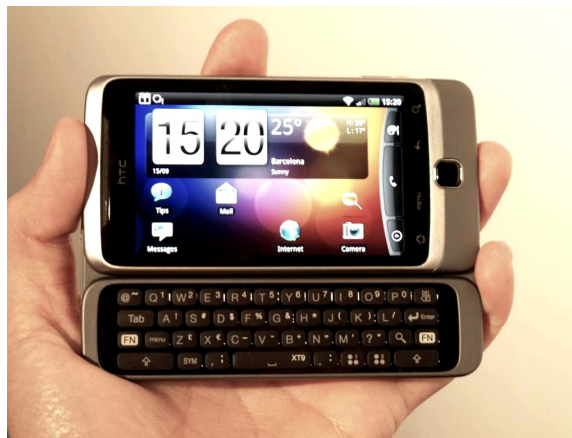
Fig. 1. Mobile phone with mini-QWERTY

The application MyTextSpeed was used to carry out the tasks. In the superior half screen, the phrase to copy is presented and in the low half screen, there is space to write the sentence. The writing duration is automatically registered, starting when the user introduces the first character and finishing when the user introduces the Enter key. In Curran's experiment this last character is not introduced, but for the system to register automatically the duration is the simplest mode. This software does not allow computing the error rate using MSD, so after finishing each subtask, a photograph of the screen was taken to control errors.