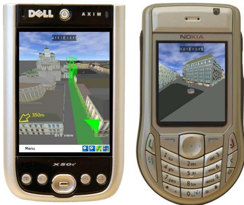
Fig. 1. mLOMA client running on Pocket PC and Symbian Series 60 platforms

mLOMA [13] (mobile LOcation aware Messaging Application) is in its essence a 3D map application optimized for mobile devices and built on top of OpenGL [9] and GLUT [6]. The mLOMA client can be used to browse a real time rendered 3D scene with a framerate acceptable for interactive use. It features a route guidance system and support for GPS location tracking. A server component is also provided. If a network connection is available, clients can receive up-to-date information on the model and interact using the server. Users can track each others' locations and communicate using messages. Messages can be public or targeted to individual users and they can be attached to any points in space or the model.