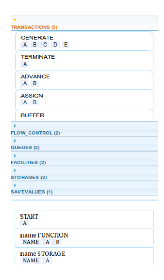
Fig. 3: Block and commands grouped by function or entity