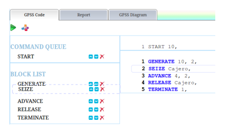
Fig. 4: Drag and Drop over the block list

have sent it to be run in the background and at the end it will output the same kind of results as any model created by hand.