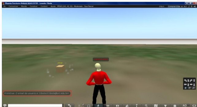
Figure 4: SQL query on the remote server

All computer systems need database access. Insert, update and search of data are operations that maintain the systems status updated. So, if we want synchronize the real and virtual worlds, we need store and handle data from both worlds. The data access was developed by a research that return the e-mail to user informed. From select operation, other operations can be performed. Figure 4 shows select command result after avatar executes a remote script by a touch in the object.