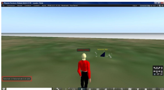
Figure 2: HTTP request from OpenSim object.

Second experiment was HTTP request to a WWW server. In virtual world the user type an integer number in a predefined channel. The LSL script sends a HTTP request to a remote server. The WWW server executes the factorial.php script returning the factorial value of the number received. The figure 2 presents the result of the request, after the avatar has touched the object.