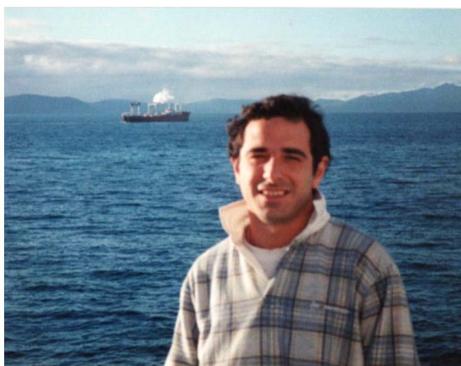
Primer embarque; observador científico a bordo, 1998