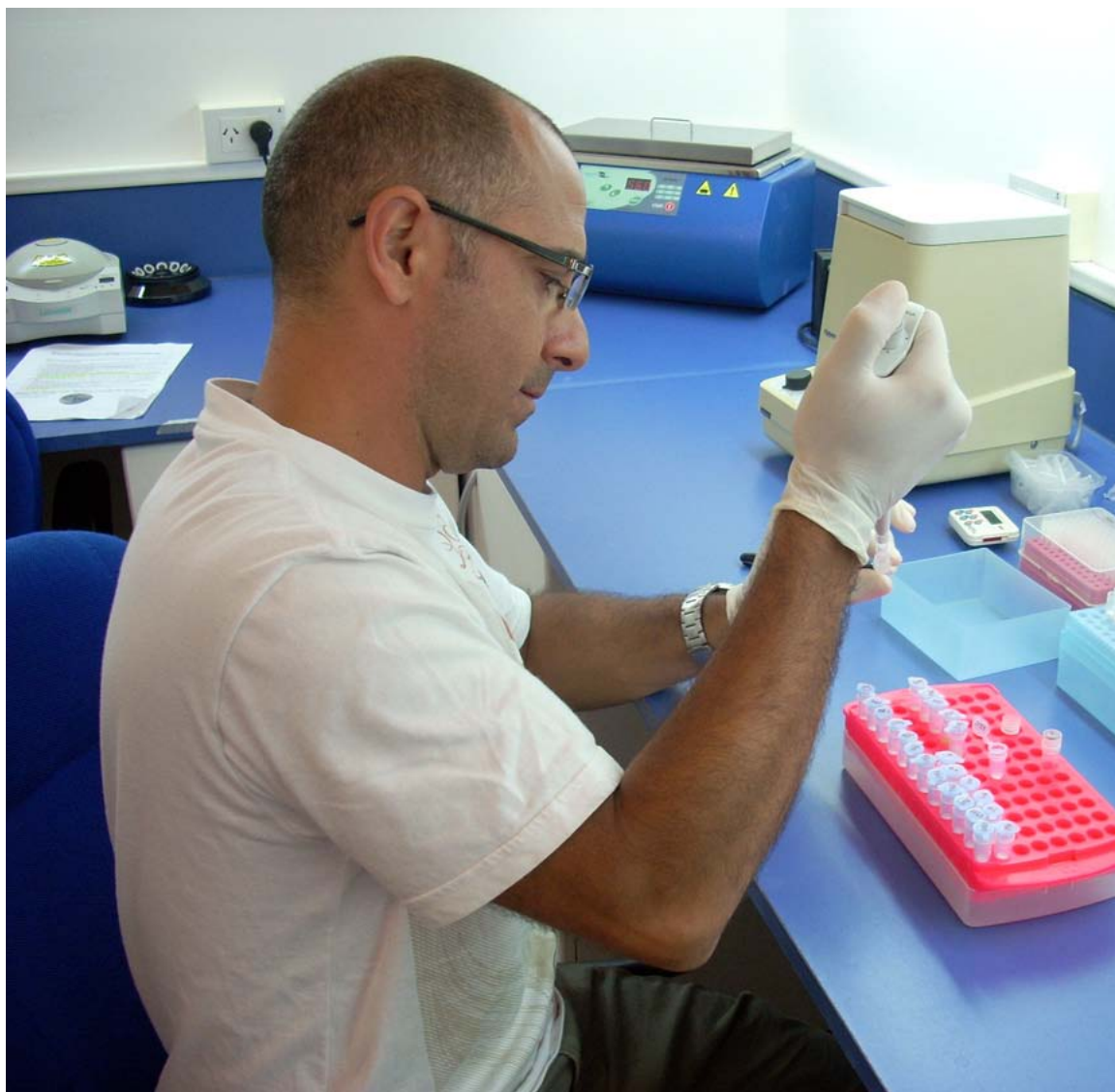
En el Laboratorio de Biotaxonomía Morfológica y Molecular de Peces (BIMOPE), 2013