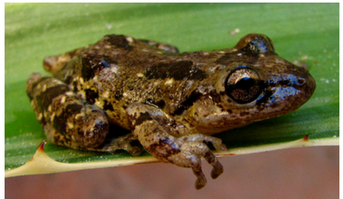
FIGURE 2. Individual collected on January 2 nd 2010 in General Villegas, Buenos Aires.

We had obtained two previous records, but in neither of them we could obtain physical evidence. On December 17 th 2009 one individual was heard in a temporary pond located at 4.5 km from the area mentioned above. This pond also had some exotic vegetation around. Lately, on February 12 th 2010, after heavy rains, at least two other individuals were heard at a nearby pond from the site where we collected the original individual, and also with the same physiognomy.