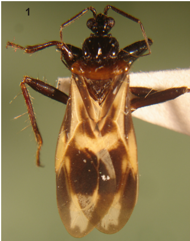
FIGURE 1. Sinnamarynus rasahusoides Maldonado Capriles and Bérenger, dorsal habitus.