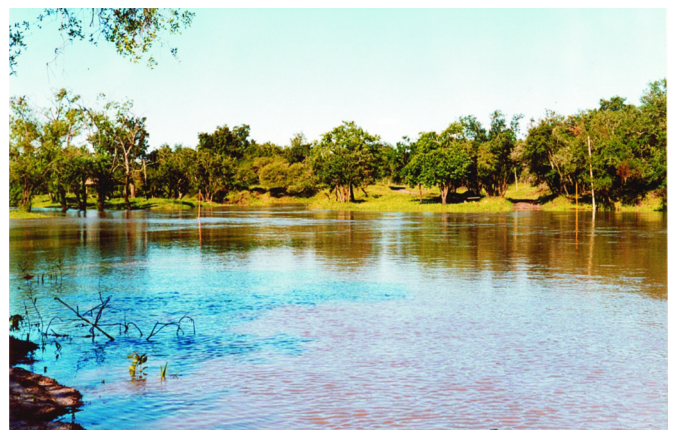
FIGURE 2. Habitat of Cyanocharax alburnus , Villaguay creek, Entre Ríos Province, Argentina.

The specimens we collected in Villaguay creek were identified as C. alburnus by the possession of two unbranched and eight branched rays in the dorsal fin, one unbranched and six branched rays in the pelvic fin, four unbranched and 20-24 branched rays in the anal fin, total number of scales in lateral-line row 37-38, scale rows between dorsal-fin and lateral line 5, scale rows between lateral line and pelvic-fin origin 3 and unpigmented adipose fin. Malabarba and Weitzman (2003) diagnose C. alburnus by the presence of a complete series of 36 to 39 perforated lateral-line scales, a character that sets it apart from those species with interrupted lateral line ( C. alegretensis , C. lepiciastus , C. tipiaia and C. uruguayensis ). Additionally, the presence of an unpigmented adipose fin distinguishes it from C. dicropotamus and C. itaimbe .