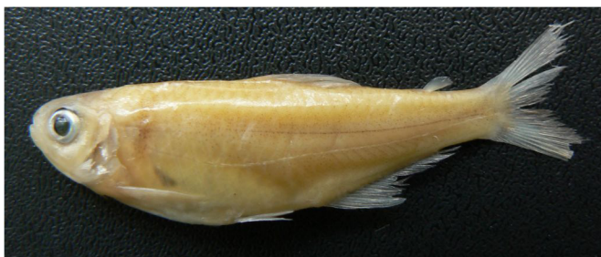
FIGURE 1. Cyanocharax alburnus , ILPLA 2172, female, 38.1 mm, Villaguay creek, Entre Ríos Province, Argentina.

In November 2004, we collected 4 specimens of C. alburnus (Figure 1, Table 1) from Villaguay creek in the beach sector at 31°55'00" S, 59°03'00" W, Villaguay Department, part of the Gualeguay River basin in Entre Ríos province, scientific permit LP N°4892/70, (Figure 2).