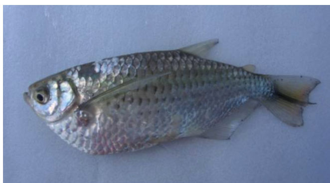
FIGURE 3. Triportheus pantanensis , ILPLA 1969, 107.46 mm SL, Laguna Blanca, Pilcomayo Department, Pilcomayo river basin, Formosa province, Argentina.