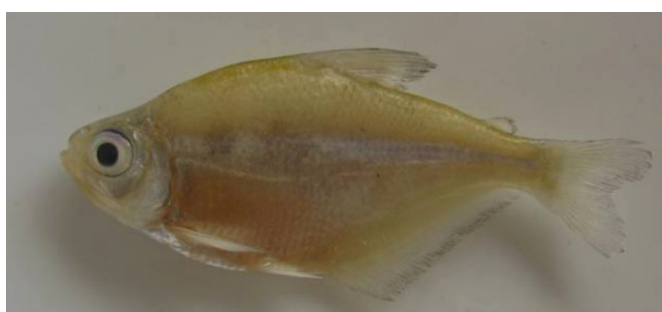
FIGURE 2. Astyanax pelegri , ILPLA 1964, 59.9 mm SL, lower Río Pilcomayo, Pilcomayo Department, Pilcomayo river basin, Formosa province, Argentina.

As a result of these surveys, two new species records are added to the ichthyofauna of the Formosa: A. pelegri (Figure 1B) and T. pantanensis (Figure 1C). The first one was previously reported in Chaco, Buenos Aires, and Santa Fe provinces. In turn, the occurrence of T. pantanensis in the RPNPRS represents the first record for Argentina and the southernmost for this species, being until now only mentioned for the Pantanal region in Mato Grosso, Brazil. These results indicate the need to gather more ichthyological information from these dynamic environments, where their hydrological regime supported by regional floods from the Pilcomayo River favors a constant rate of recolonization and exchange of species.