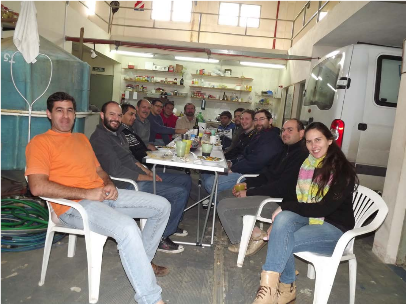
Almorzando en los viernes culturales del INICNE, 2013