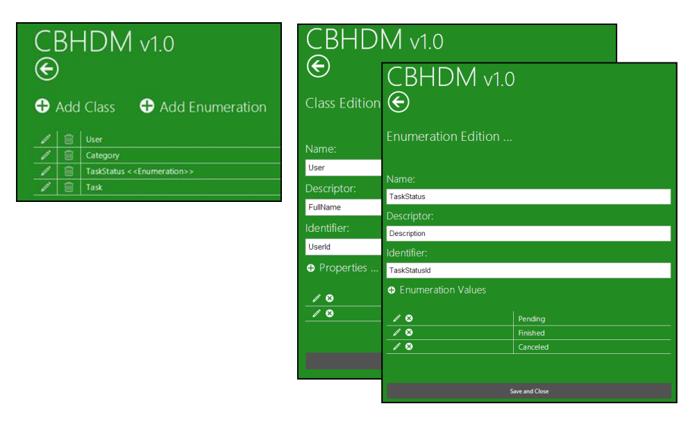
Fig. 2: Screenshots of the tool support for Data Model

Support tool allows adding classes and enumerations (Figure 2, left) easiness the process of configuring the special properties (Figure 2, right).