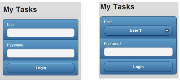
Fig.5. Pages automatically created from Login Components

• Login: a component to authenticate the user on the system. It configuration allows defining to the properties of the class to perform the authentication (See Figure 5 left). The component can also be configured in order to allow the user to be selected instead of having to be typed (Figure 5 right). This feature is useful for mobile devices with few users, minimizing text input, which is a complex tax especially on small devices with reduced keyboards.