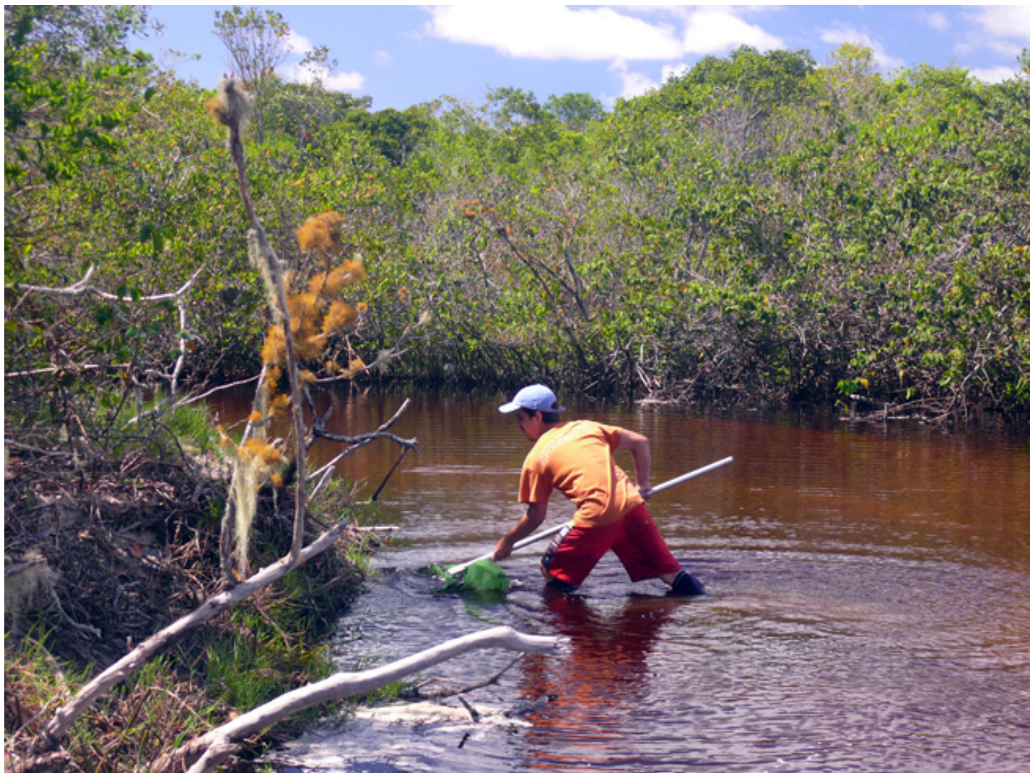
Coleta Ilha do Mel, Paraná, Brasil, 2013