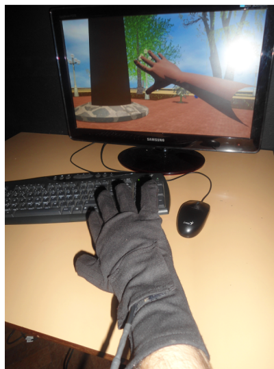
Fig. 2. Real time Imitation Feature.