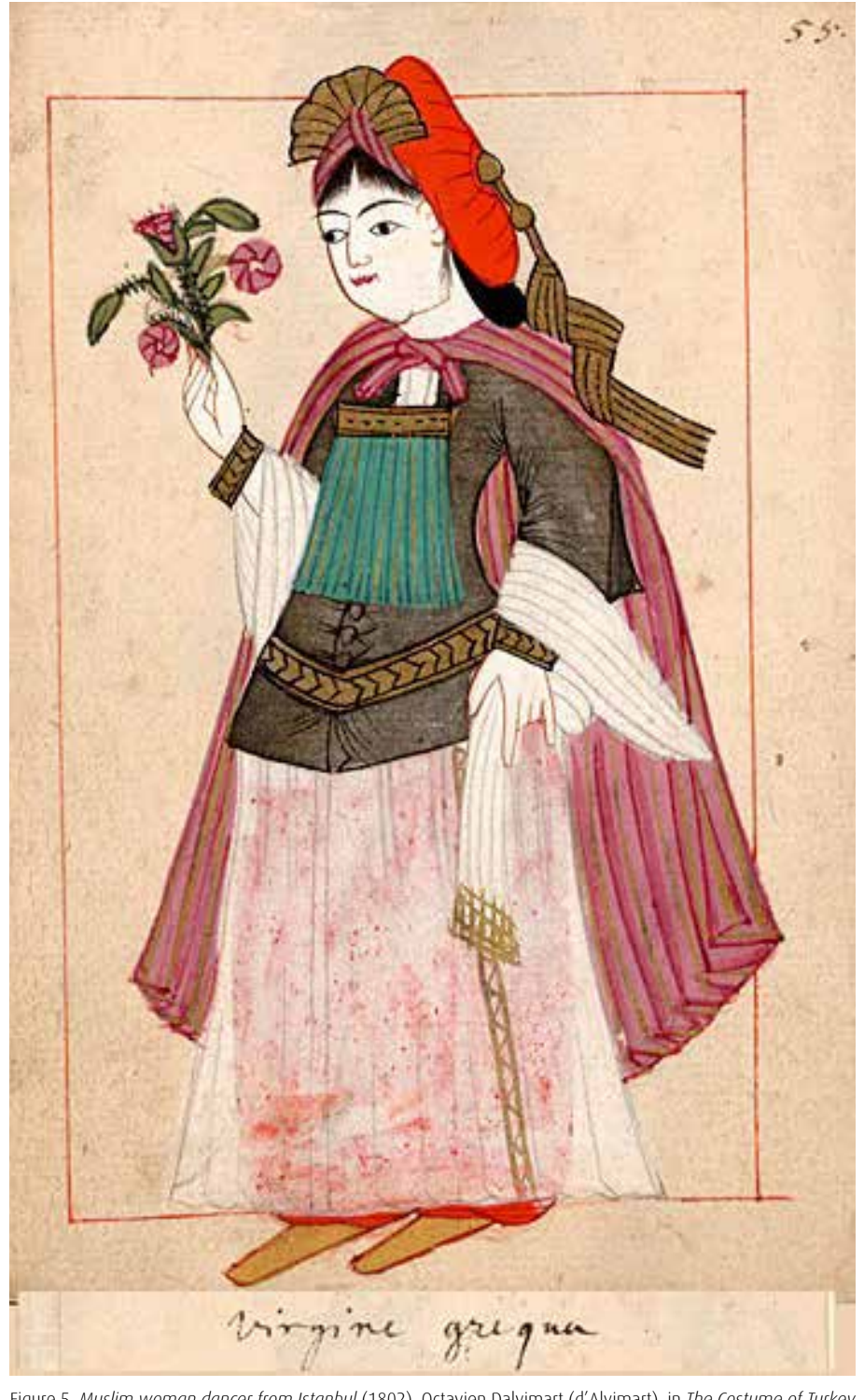
Figure 5. Muslim woman dancer from Istanbul (1802), Octavien Dalvimart (d'Alvimart), in The Costume of Turkey

The last encounter that I have reached is the evolution of this cultural encounter. As a last example, in the paintings of Octavien Dalvimart, we can see some descriptions of Turkish and Muslim women with some certain similar dresses. He came to Turkey in about 1798 and made his drawings. In his album titled The Costume of Turkey, he describes an odalisque, a sultana, Turkish women with provincial dress and in typical costume of Istanbul [Figure 5], and Muslim dancer woman. On the other hand, he also made paintings about Greek women from different islands with their local clothes, hair dressings and accessories.