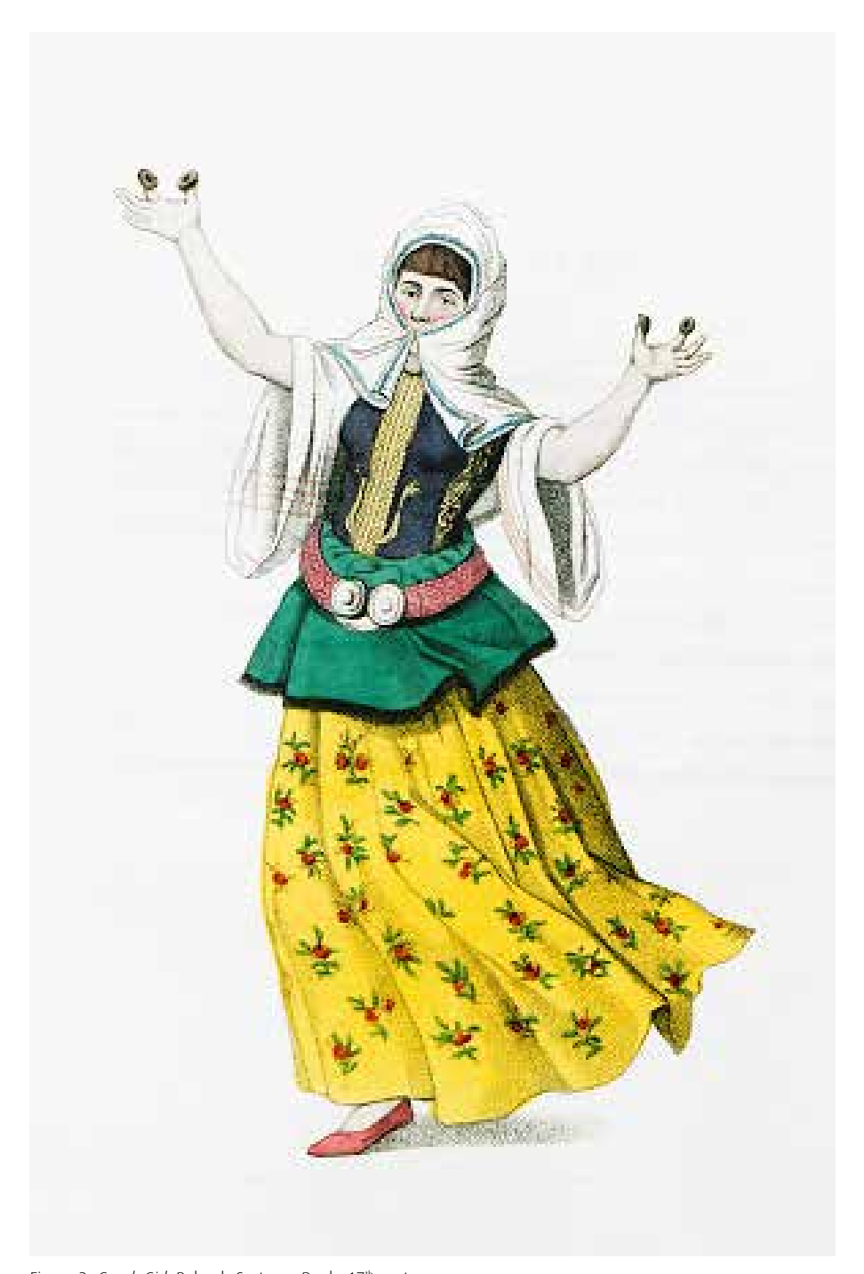
Figure 3. Greek Girl . Ralamb Costume Book, 17<sup>th</sup> century

Another important collection including very attractive paintings belongs to Jean Baptiste Vanmour (1671-1737), which is quite significant to compare with Levni's paintings because many scholars assert that it can be possible to find some connections and similarities among their paintings. He came to Istanbul in 1699 and it is known that he did not leave the city until his death in 1737. Under the title of Illustrations of Turkish Civilians , we can see Turkish women's representations as resting on the sofa, having bath [Figure 4], playing canon, and dancing. Gül İrepoğlu (1999) considers a possible similarity between Levni's and Vanmour's paintings in terms of postures and expressions of figures. Moreover, she emphasizes the traditional attitude of Levni in his paintings as a difference but despite that, she asserts that Vanmour and some other foreign painters come to Istanbul can make Levni's viewpoint expanded due to their paintings' robust stances.