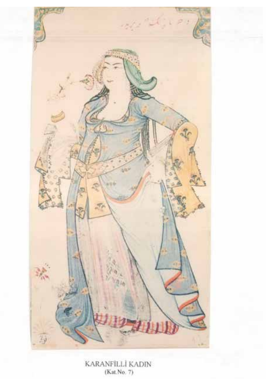
Figure 1. Woman with Carnation, Levni