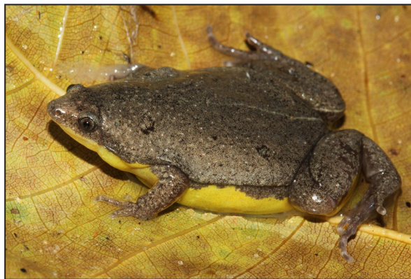
Figure 2. Elachistocleis matogrosso (CZPLT-H-517) from Reserva Natural de Laguna Blanca, San Pedro, Paraguay.