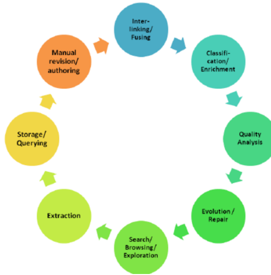
Figure 1: Linked Data Life-Cycle

by means of users. At the same time, this data must be linked to related data from different publishers, as required by Linked Data principles. Since Linked Data tries with raw data, approaches for classification and enrichment must be also provided in order to make efficient queries. Once problems are detected after analysing quality, strategies to repair them are required together with other strategies to support evolution. Finally, the life-cycle proposes to empower users by means of mechanisms to browse, search and explore its structured data in a friendly manner.