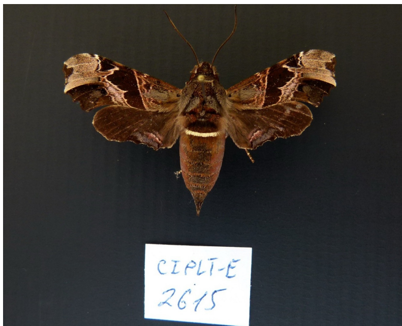
Figure 4. Unzela japix (CZPLT 2615).