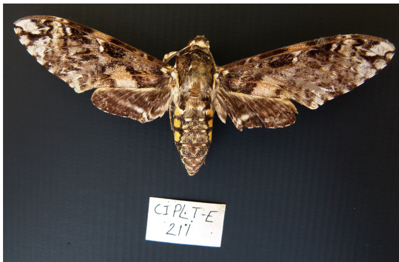
Figure 3. Manduca leucospila (CZPLT 211).