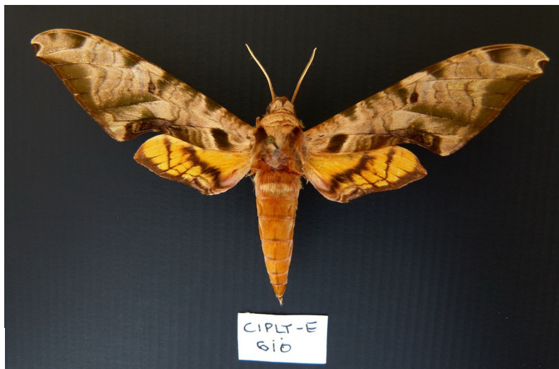
Figure 2. Protambulyx eurycles (CZPLT 610).

another that has been generally omitted from Paraguayan lists: Callionima guiarti (Figure 5). The specimen number is given in italics followed by collection date in parentheses.