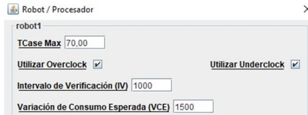
Fig. 4. ECMRE - Performance adjustment parameters in the Robot/Processor section

The performance adjustment algorithm in each robot works as follows: For each instruction that is executed, it assesses the following: