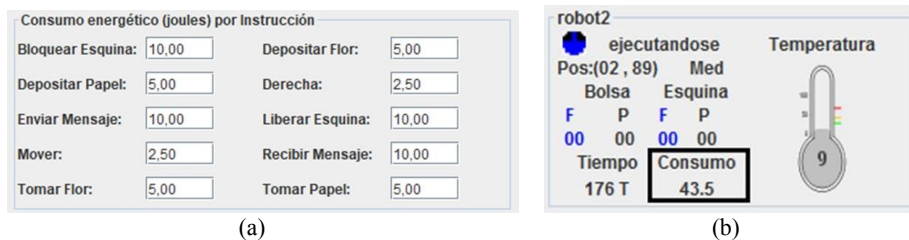
Fig. 2. ECMRE (a) Energy consumption by instruction in the Robot/Processor section, (b) Execution Information area, where robot energy consumption information is displayed

ECMRE adds a new section called Robot/Processor where energy consumption options can be set (in Joules) for a set of primitive instructions (Fig.2(a)). Based on this, each robot stores its own consumption information and updates it during algorithm execution, which is displayed in the Execution Information area (Fig.2(b)).